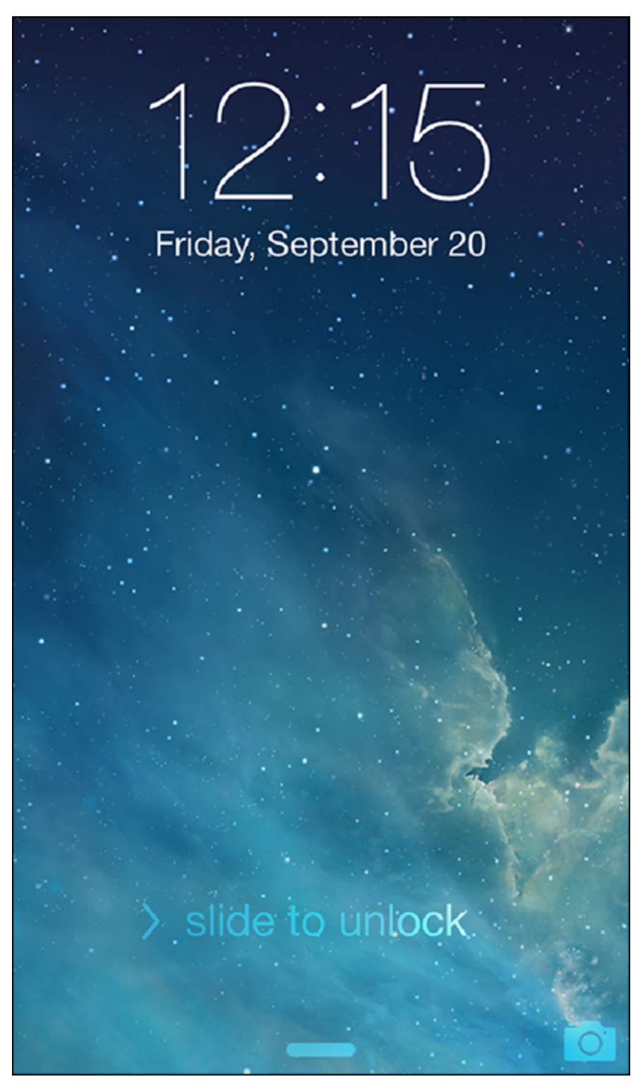
1.2 Slide your finger along the screen from left to right to unlock your iPhone.