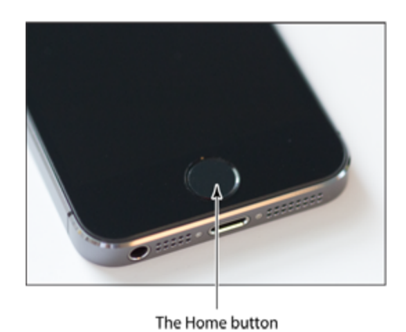
1.1 Press the Home button to (among other things) leave standby mode or to return to the Home screen.

The starting point for most of your iPhone excursions is the Home button, which is the circular button on the face of the phone at the bottom, as shown in Figure 1.1. The Home button has five main functions: