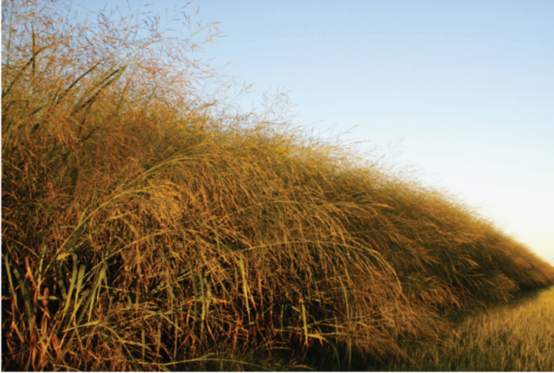
Figure 2.1. A seed production field of the lowland switchgrass cultivar “Cimarron” in September, toward the end of the growing season, near Perkins, OK.

bioenergy seed trade as EG1101, EG1102, and EG2101, respectively ( http://www.bladeenergy.com/SwitchProducts.aspx ).