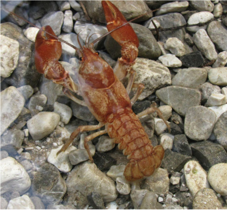
The white-clawed crayfish, Austropotamobius pallipes complex