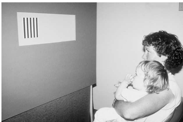
FIGURE 1-1. Teller acuity preferential looking apparatus.

Many ingenious tests have been devised to try to better correlate the vision to a linear acuity and detect amblyopia. The most popular are forced-choice preferential looking (FPL) and pattern visual evoked potentials (PVEP). The preferential looking test using Teller acuity cards assesses grating acuity by presenting the child with high-contrast gratings of various spatial frequencies along with a paired blank card. Infants will naturally prefer to look at patterns if they can be seen, and the examiner assesses whether the child fixates on the pattern or not. 36 This test reliably measures grating acuity, but it may take 20 to 30min to perform and may be difficult to perform monocularly in children younger than 2 years old 33 (Fig. 1-1). Although useful in the assessment of anisometric or deprivation amblyopia, this test