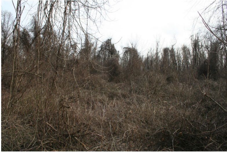
Figure 2.4 Connecticut River floodplain forest breaking down under a heavy load of invasive oriental bittersweet and turning into a weedy vine thicket, West Springfield, Massachusetts, March 15, 2013.

times more frequently than native Vitis species (Marks et al., 2014), and it is therefore going to affect tree recruitment and old field succession more often. Celastrus orbiculatus can become so dominant in the herb and shrub layer of forest openings that it prevents tree sapling recruitment. Similarly, researchers have observed that C. orbiculatus can arrest or even reverse succession in old fields (McNab and Meeker, 1987; Fike and Niering, 1999). Therefore the impact of C. orbiculatus -caused tree mortality may be cumulative, unlike other sources of mortality that result in only temporary forest canopy gaps. The Connecticut River floodplain forest mortality study estimated that floodplain forest basal area is currently destroyed by C. orbiculatus at a rate of 0.2% per year (Marks and Canham, 2015). If left unchecked for decades, the cumulative loss of forest area owing to C. orbiculatus could be comparable to the potential future impact of emerald ash borer. Fraxinus made up 7.4% of the floodplain forest in the study. At a constant rate of 0.2% per year, it would take just 39 years for C. orbiculatus to destroy a comparable 7.4% of the forest. Thus, although it moves more slowly than an insect pest or pathogen, the cumulative impact of this invasive liana may be just as severe.