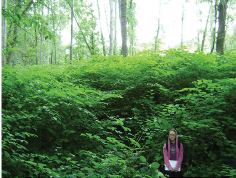
Figure 2.3 Forlorn TNC intern standing surrounded by Japanese knotweed in a high-gradient river floodplain forest on the Green River in Massachusetts, June 23, 2009.

knotweed not only transforms the understory of floodplain forests on high-gradient rivers but can eventually also reduce riparian forest cover by preventing tree seedling recruitment. A lack of riparian trees, with their extensive root systems, increases bank erosion (Secor et al., 2013). This ecological impact of Japanese knotweed was one of the motivations behind an international program (USA, Canada, and the UK) to attempt to develop an effective biological control project against Japanese knotweeds (Shaw et al., 2009; Grevstad et al., 2013). The first agent, the psyllid Aphalara itadori Shinji, in this project is currently under review in North America and being field-tested in England.