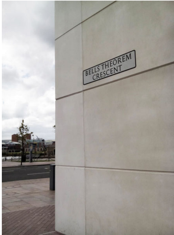
Fig. 2 The Belfast City Council named a street “ Bells Theorem Crescent ” in the Titanic Quarter of Belfast to honour its eminent scientist John Stewart Bell.

His [Bell’s] passion for understanding, uncompromising honesty, simplicity of lifestyle and demeanour, dignity, courtesy, generosity to other scientists, and passion for social justice were combined into a character that was inspiring to all who had the privilege to be acquainted with him.