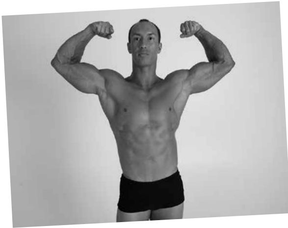
A strong, well-conditioned body is not just muscular...

Don't put unnecessary pressure on yourself. Nowhere else are promises so lightly made and tricks so casually employed as in the health and fitness industry. Don't be put off by those fitness models who smirk at you from magazine covers. Those photos are almost always the product of diuretics and other drugs, extreme dieting, fake tans, a good pump, and oil, plus perfect lighting and the magic of Photoshop editing. Don't get me wrong, the models still deserve credit, but I assure you they don't walk around looking like that on a daily basis. Quite the contrary! And forget the massive bodybuilders—most of those guys aren't fit at all. In fact, their addiction to more muscle at all costs compromises their health and athletic performance. In my view, it's a backwards approach: they train to look like they have a lot of physical ability, but their methods often lead to injuries, long-term health problems, and very little functional value outside of the gym. You and I, we will train to attain physical ability. And an attractive physique will be the by-product, because it's the appearance of ability, and the confidence that comes with it, that people are attracted to, not the muscles.