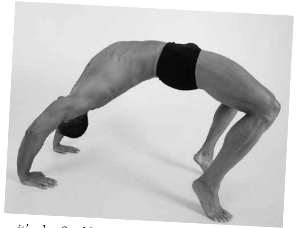
... it's also flexible!

Don't put unnecessary pressure on yourself. Nowhere else are promises so lightly made and tricks so casually employed as in the health and fitness industry. Don't be put off by those fitness models who smirk at you from magazine covers. Those photos are almost always the product of diuretics and other drugs, extreme dieting, fake tans, a good pump, and oil, plus perfect lighting and the magic of Photoshop editing. Don't get me wrong, the models still deserve credit, but I assure you they don't walk around looking like that on a daily basis. Quite the contrary! And forget the massive bodybuilders—most of those guys aren't fit at all. In fact, their addiction to more muscle at all costs compromises their health and athletic performance. In my view, it's a backwards approach: they train to look like they have a lot of physical ability, but their methods often lead to injuries, long-term health problems, and very little functional value outside of the gym. You and I, we will train to attain physical ability. And an attractive physique will be the by-product, because it's the appearance of ability, and the confidence that comes with it, that people are attracted to, not the muscles.