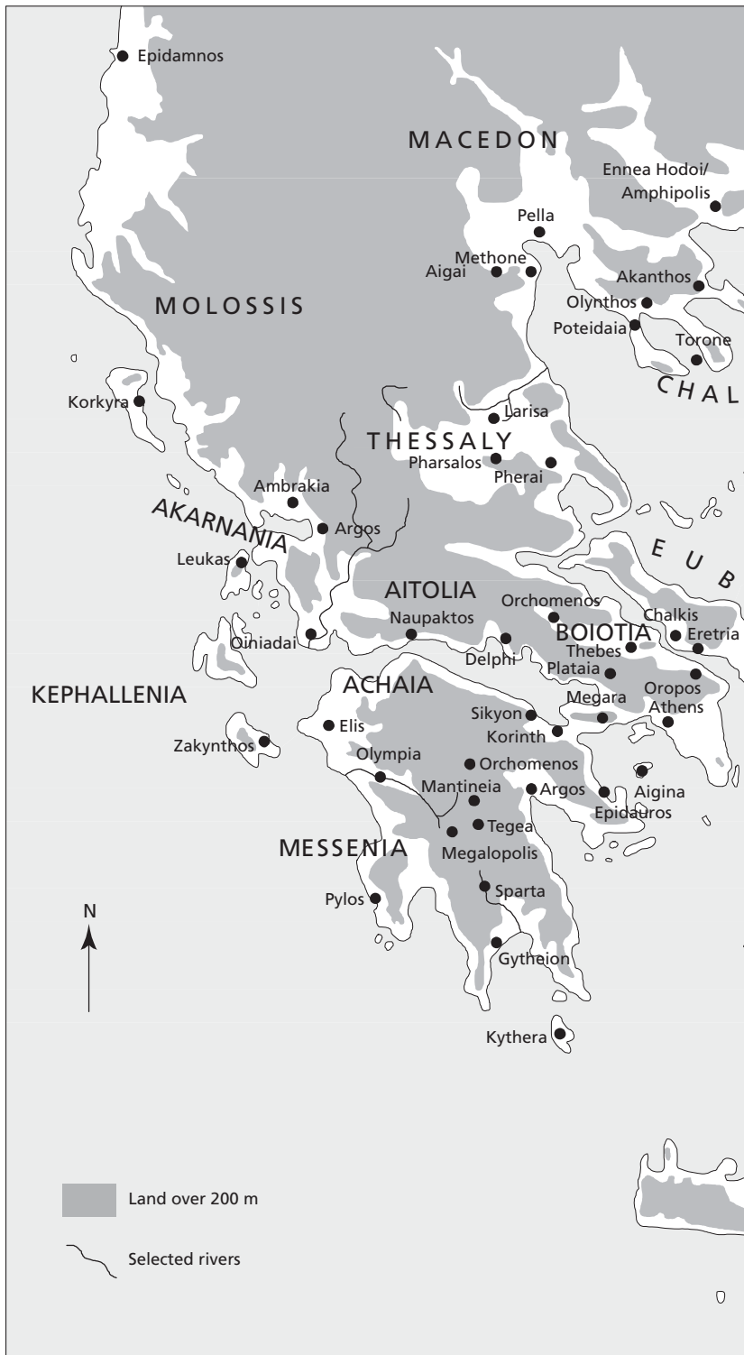
Map 1 Greece