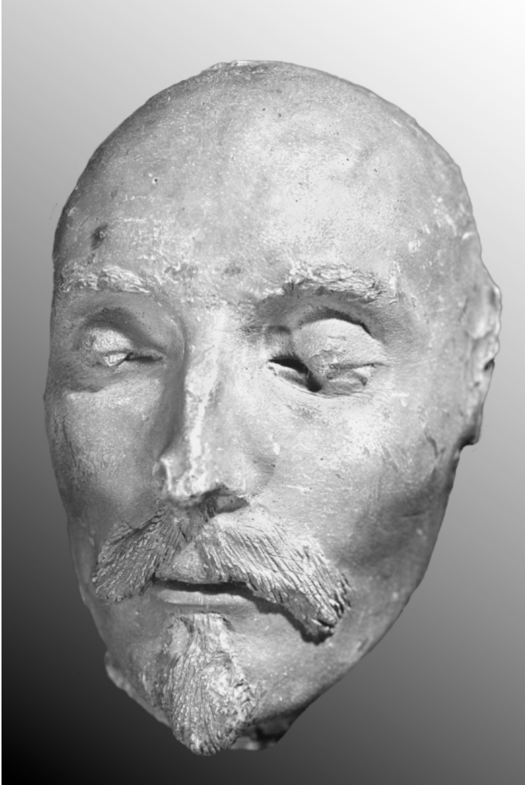
The death mask is perhaps what Shakespeare ought to look like, unlike the figure mounted on the north wall of the