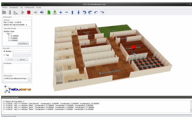
Fig. 3 Graphical User Interface of the ALZ-MAS 2.1

In ALZ-MAS 2.0, the system could only know in which room each user was, because location was based on knowing which door ( i.e. , RFID antenna) a user was passed through. In ALZ-MAS 2.1 the location of users is given as coordinated points obtained from the locating techniques provided by the n-Core API. All information obtained by means of these technologies is processed by the agents. Nonetheless, thanks to the architecture of the system, it was not necessary to introduce any change into the agents' reasoning mechanisms. Depending on the system requirements, several interfaces can be executed. The interfaces show basic information about nurses and patients (name, tasks that must be accomplished, location inside the residence, etc.) and the building (specific room temperature, lights status, etc.). Figure 3 shows one of the new user interfaces of ALZ-MAS 2.1., where it is shown the positions of the users given by the new locating engine.