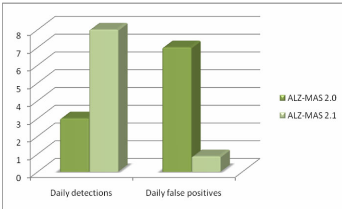
Fig. 4 Comparison of the daily number of detected accesses to restricted areas and false positives between ALZ-MAS 2.0 and ALZ-MAS 2.1

ALZ-MAS when detecting users accessing to restricted areas according to their permissions. ALZ-MAS monitors and locate the patients and guarantees that each one of them is in the right place, and secondly, only authorized personnel can gain access to the residence protected areas. Figure 4 shows the number of accesses to restricted zones detected before the implementation of ALZ-MAS 2.1 with the previous release of ALZ-MAS 2.0 during a 30-day period. With the new release of ALZ-MAS 2.1 using new ZigBee devices and more accurate locating techniques, there is an improvement regarding the previous ALZ-MAS version, increasing from 3 to 8 daily detections. Furthermore, thanks to the new innovative locating techniques, the number of daily false positives has been reduced from 7 to 0.87.