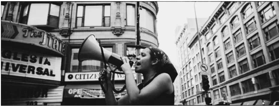
Plate 1.3 Los Angeles, May 2003.