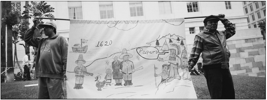
Plate 1.4 Los Angeles, May 2006.