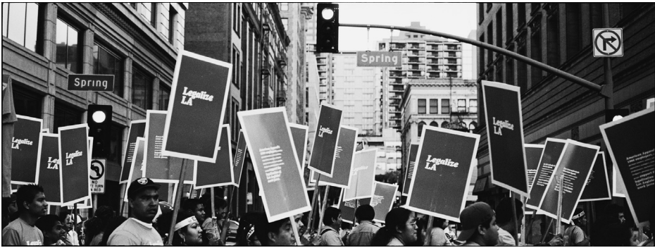
Plate 1.2 Los Angeles, May 2003.