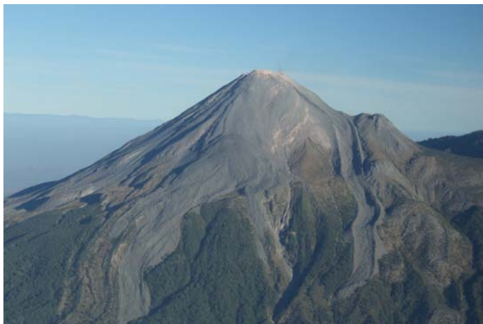
Figure 1.1 Colima volcano with lava flows and pyroclastic flows which have destroyed parts of the woodland around the mountain flanks.

Many volcanoes, particularly of andesite composition are composite in the sense that they comprise both lava and pyroclastic materials and have a steep irregular conical form (for example, Figure 1.1). Such volcanoes are built by flow of lava down depressions around the volcanoes and the eruption of pyroclastic materials; they commonly have diameters of 10–40 km. Volcanoes associated with mainly basaltic eruptions form relatively low relief shallow sided volcanoes