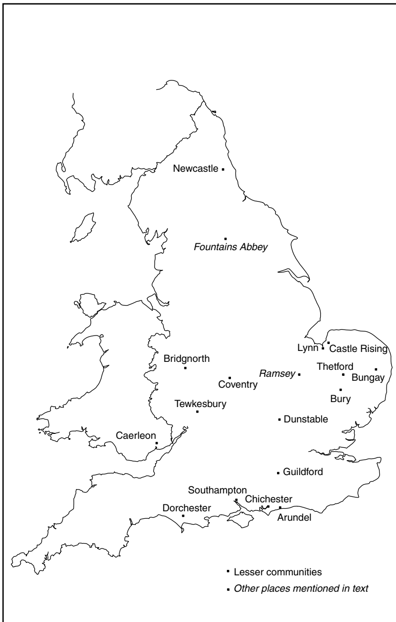
Map B The English medieval Jewry: lesser communities