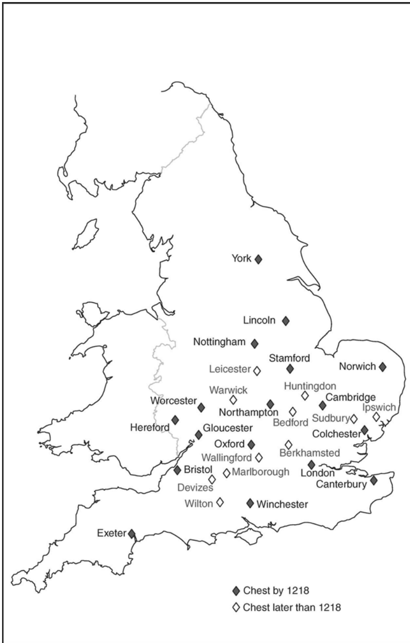
Map A The English medieval Jewry: communities with chests