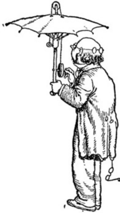
THE PROFESSOR'S UMBRELLA