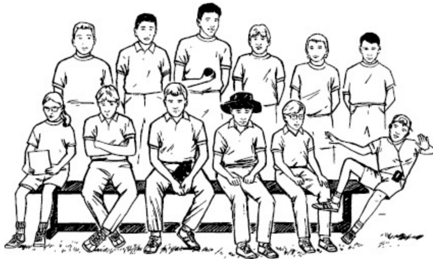
Back Row: Frankie, Clive, Cal, Marty, Erica and Tylan Front Row: Jo, Matthew, Hooker, Azzie, Jacky and Ohbert.

We were lining up for our team photograph before the big game against Barmewell. It was Glory Gardens C.C.’s first game in the North County League.