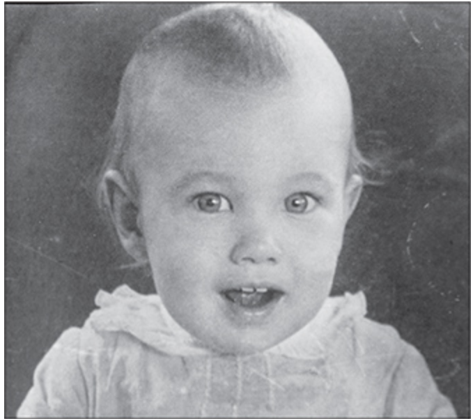
James Maury Henson in 1937, at about six months old.

DEER CREEK WINDS casually, almost lazily, through the muggy lowlands in the heart of the Mississippi Delta. Its point of origin—near the little town of Scott, in Bolivar County—lies roughly ninety miles north of its terminal point at the Yazoo River three counties away. But Deer Creek takes its time getting there, looping and whorling back and forth in a two-hundred-mile-long amble, looking like a child's cursive scrawled across the map.