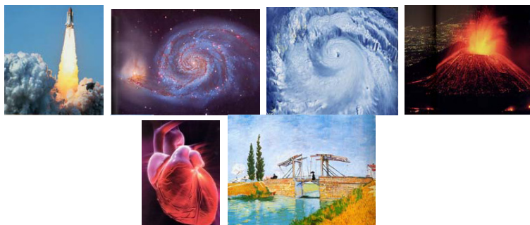
Fig. 1. The fascinating picture of the start of a discovery, a piece of universe, a tornado, a volcano, flows in the human heart, or even the “pure” water or the sky in Van Gogh’s painting are, in fact, different forms of multiphase flows

Multiphase flows, such as rainy or snowy winds, tornadoes, typhoons, air and water pollution, volcanic activities, etc., see Fig.1, are not only part of our natural environment but also are working processes in a variety of conventional and nuclear power plants, combustion engines, propulsion systems, flows inside the human body, oil and gas production, and transport, chemical industry, biological industry, process technology in the metallurgical industry or in food production, etc.