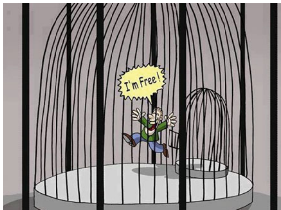
Fig. 1.2 A trivial cartoon that surfaced widely on the internet in 2013 depicting a person released from prison into terrestrial society. However, it very succinctly raises the central question which this book explores—will the apparent freedom of escaping the Earth merely leave humans at the mercy of other forms of entrapment or tyranny in the very societies they construct, regardless of the spatial scale of the interplanetary and interstellar environment?

It is evident that finding solutions to tyrannical extraterrestrial leadership depends much on the character of constituted authority and the form of government. Ian Crawford explores the nature of federalism beyond Earth and its suitability as a means to realising collectivist needs, while maintaining the maximum amount of freedom. He shows that by drawing on the lessons learned on Earth, there is much that can be done in advance to shape a future in space where liberty is maximised.