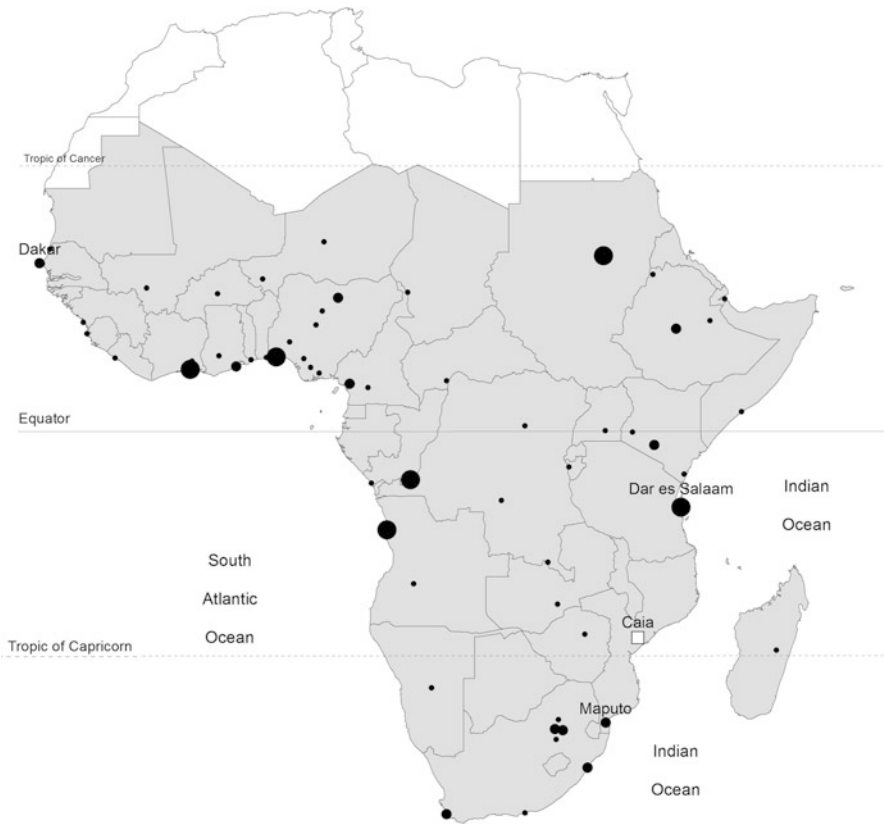
Fig. 1 The 42 largest cities south of the Sahara in 2010. Over 6 million inhabitants ( very large dot ), 4–5 million ( large dot ), 2–3 million ( medium dot ), 1–2 million ( small dot ) (formulated by E. Ponte based on data published by UN-Habitat’s State of the World’s Cities 2012/2013. Prosperity of Cities, 2012)

climate change (Chap. 2) in urban studies. The body of the book then presents relevant case studies (Chaps. 3–14), followed by conclusions and recommendations (Chap. 15).