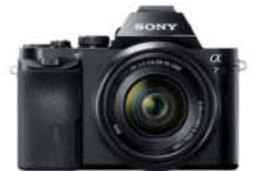
Sony Alpha a7 Mirrorless Digital Camera with 28-70mm $1,298.00