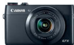
Canon PowerShot G7-X Compact Digital Camera with 20.3 Megapixel $649.00