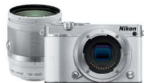
Nikon 1 J5 Mirrorless Digital Camera with 10-100mm VR Lens $896.95