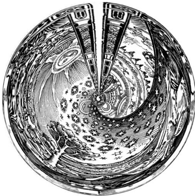
Fig. 1.1 The flatness conjecture and the question of an infinite or a finite space reappear in the history of understanding the structure of our world. Riemann's geometry and Einstein's theory of gravitation have proposed solutions in terms of the possibility of curved finite space-forms without boundary. Still, contemporary cosmology rests on the assumption of an infinite space without curvature. This article explains a recently opened research field aiming to explain the Dark Energy and Dark Matter problems by generalizing the cosmological model in the spirit of this old question and its proposed answers