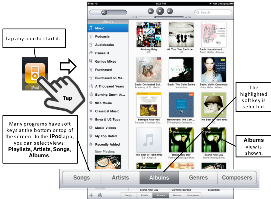
Figure 2. Working with soft keys in apps