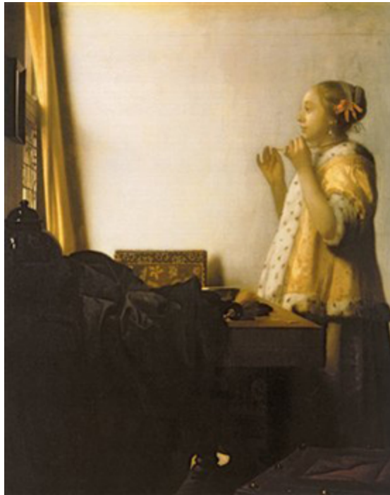
7. Johannes Vermeer, Woman with a Pearl Necklace , c. 1664. Oil on canvas, 55 x 45 cm. Gemäldegalerie, Staatliche Museen zu Berlin, Berlin.

The very influential classes of society, with their special political rights, lost their influence and privileges during the war. Only the princes governed their respective areas with unlimited power. The situation of the arts and culture in their lands changed according to the personalities, the wisdom and the farsightedness of the respective princes.