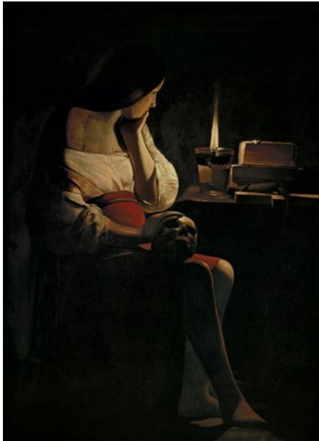
6. Georges de La Tour, Magdalene of the Night Light , c. 1640-1645.

Oil on canvas, 128 x 94 cm. Musée du Louvre, Paris.