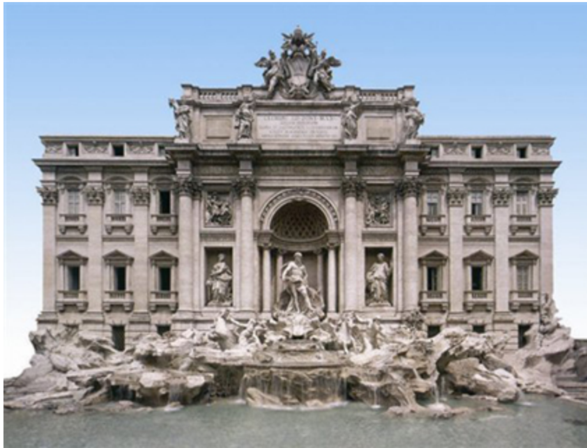
3. Niccolò Salvi (finished by Niccolò Pannini ), Trevi Fountain , 1732-1762. Marble. Piazza di Trevi, Rome.

The German imperial crown hardly played a legal role; it only possessed a more or less representative function gladly carried out by the House of Habsburg. In Austria the Habsburgs had occupied the area of Krain (current Slovenia), Kärnten (Carinthia) and Tyrol and, after long internal strife from the end of the fifteenth century into the 1690s, combined them into a single state to withstand the onslaught of the Ottomans. It was only the famous Prince Eugene of Savoy who succeeded in defeating the “Turks” at the battle of Zenta in 1697. This victory was memorialized by Ferdinand Freiligrath in a poem later set to music by Johann Gottfried Loewe: “Prinz Eugen, der edle Ritter, / hei das klingt wie Ungewitter / Weit ins Türkenlager hin. ...”