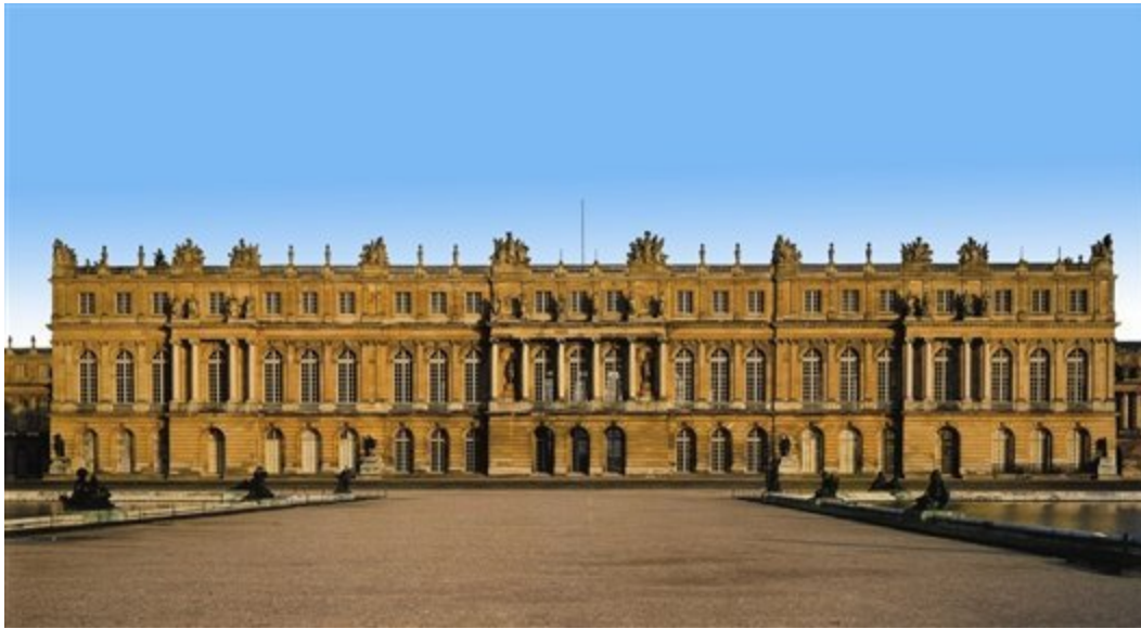
5. Louis Le Vau and Jules Hardouin-Mansart , Versailles Palace , façade with view of the gardens, 1661-1690. Versailles.