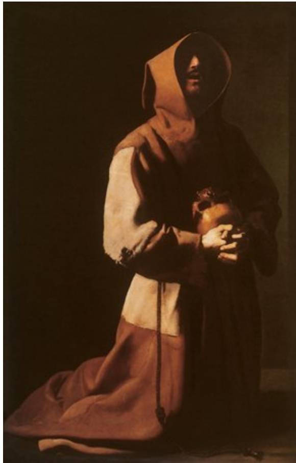
8. Francisco de Zurbarán, St. Francis in Meditation , c. 1635-1640. Oil on canvas, 152 x 99 cm. The National Gallery, London.