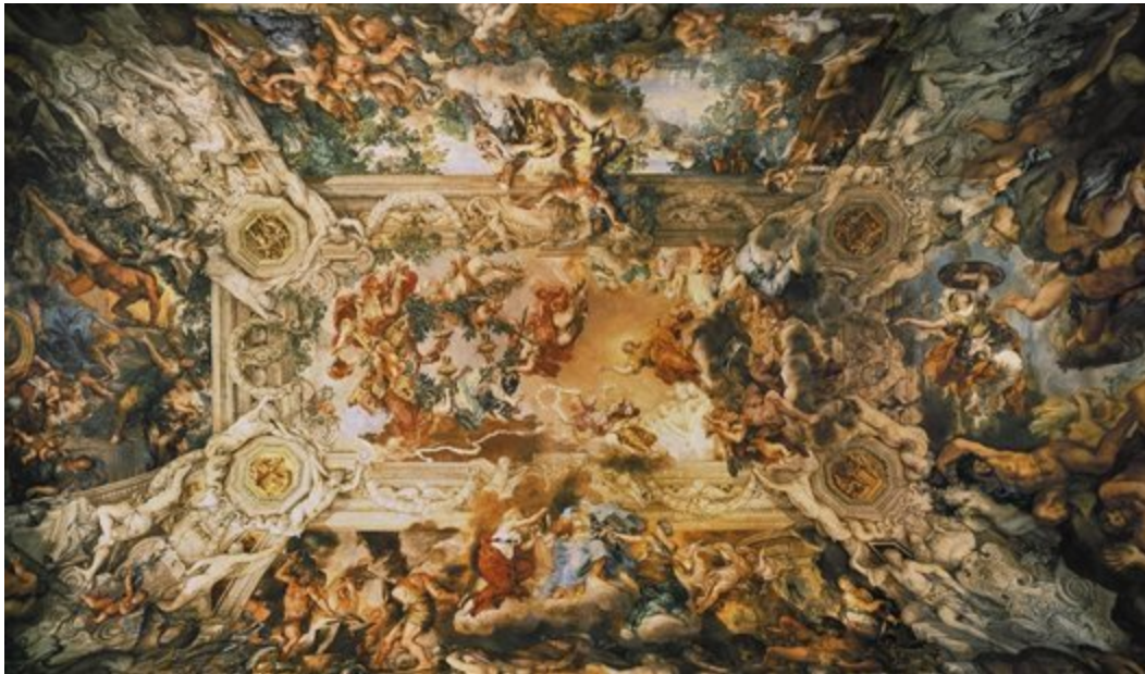
2. Pietro Berrettini , also known as Pietro da Cortona , Allegory of Divine Providence , 1633-1639. Fresco. Palazzo Barberini, Rome.