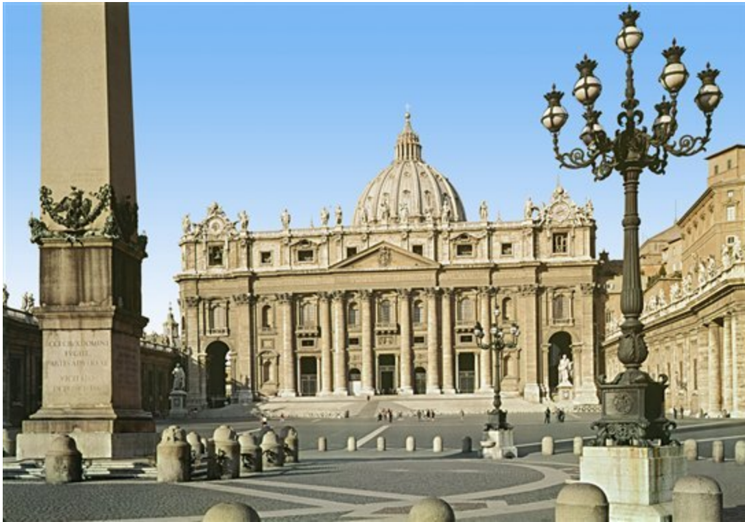
10. Carlo Maderno, St. Peter's Basilica , façade, 1607-1614. Vatican.