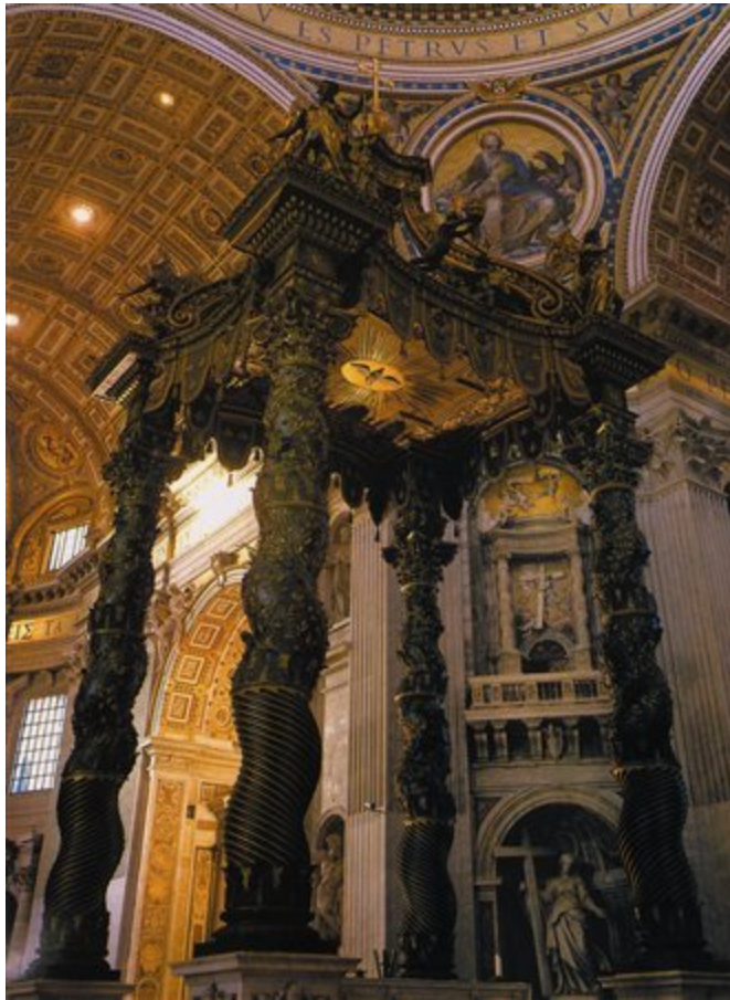
1. Gian Lorenzo Bernini, Baldachin , ordered in 1624 by Urban VIII. St. Peter's Basilica, Vatican.