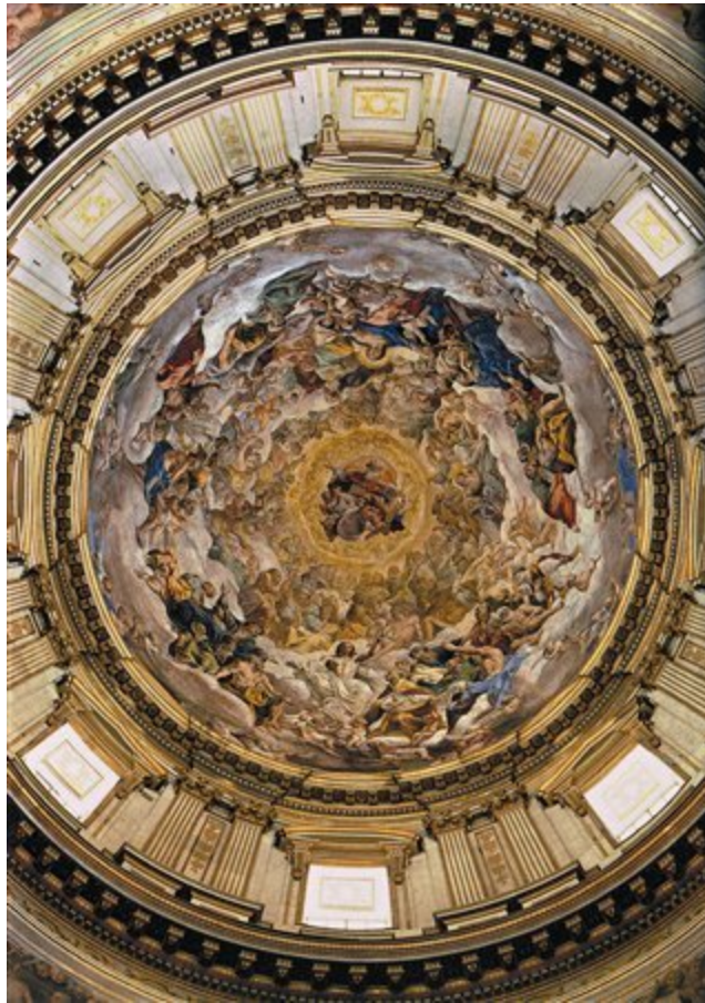
4. Giovanni Lanfranco, Paradise , 1641-1643. Fresco. Cappella San Gennaro, Cattedrale di Napoli, Naples.