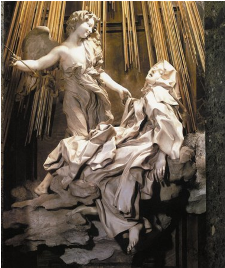
9. Gian Lorenzo Bernini, Ecstasy of St. Teresa , 1647-1652. Marble, h: 350 cm. Cappella Cornaro, Santa Maria della Vittoria, Rome.