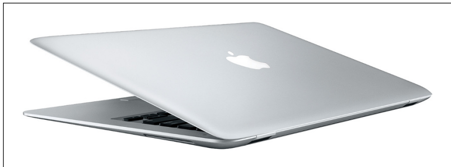
FIGURE 1-2: Behold the MacBook Air.

Consider the least expensive MacBook: the 13-inch MacBook Air (shown in Figure 1-2), which is unique for both its size and weight. Yet the Air is just like the MacBook Pro. Well, mostly.