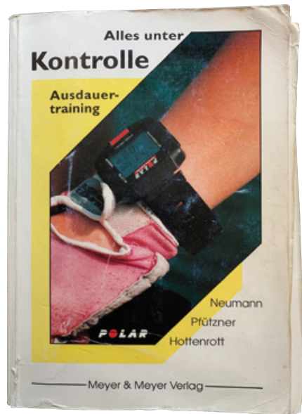
Figure 1: Alles unter Kontrolle (Everything Is Under Control).

A few years ago, I wrote short stories about all things pertaining to long-distance triathlon in the form of a blog for magazines, or rather for the athletes in my care. To me, sharing knowledge was and is a labor of love because as an athlete and coach I, like many other people in everyday life, made some mistakes. But in my view, it is precisely those mistakes that ensure the survival of mankind, because anyone with the ability to self-reflect, recognize mistakes, and use them to make changes will emerge stronger and more knowledgeable.