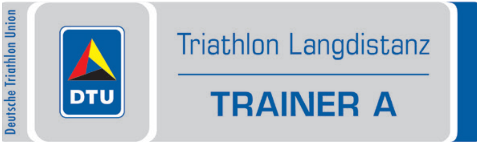
Figure 3: License badge issued by the German Triathlon Union (DTU).

In 2020, the German Triathlon Union (DTU) launched an initiative that issues a digital logo to coaches who are licensed by the organization so they can be easily identified as qualified coaches and trainers on their websites and in other marketing materials, enabling them to set themselves apart from coaches without a valid education.