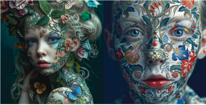
Figure 1-5. Skin made from whimsical elements (5.2R)

Prompt: Skin made from whimsical elements (version 5.2R, see Figure 1-5)