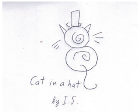
Figure 1. Before