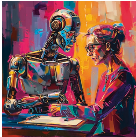
Figure 1-7. Midjourney and you

My journey with Midjourney’s prompting has been delightful and effortless, with some exceptions when specific requirements were involved. For instance, creating book character illustrations and images for social media for professional use and producing ordered prints have presented challenges. I recall struggling in the Midjourney v4 phase to depict a classroom with laptops, even without including people. Nonetheless, I’ve learned to better balance Midjourney’s inventive nature and the level of detail in the prompt needed to capture the intended idea.