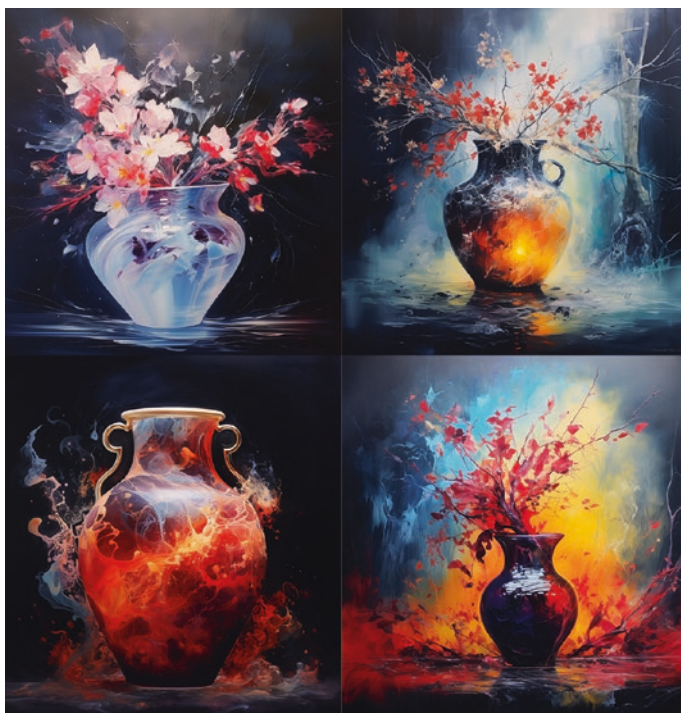
Figure 1-3. Unusual vases

A mix of several qualifiers has created an unusual look.