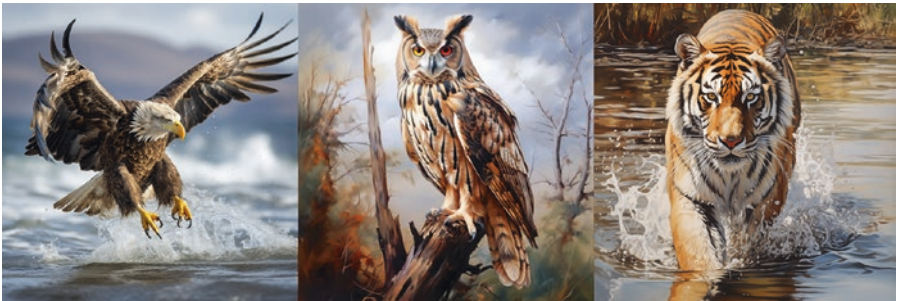
Figure 1-2. Wild animals

Prompt: Masterpiece gorgeous eagle full body photorealistic wildlife art, action paintings, naturecore, figurative naturalism, impressionist coloration shades --v 5.2 (see Figure 1-2)