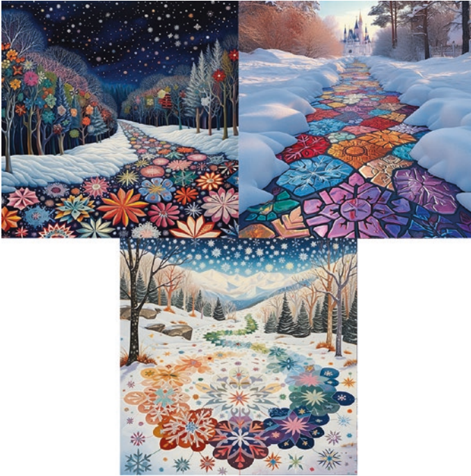
Figure 1-6. Snowy landscape with mosaic