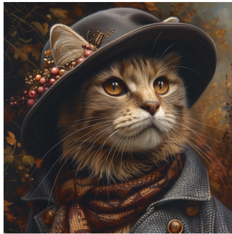
Figure 2. After

AI Image creation has become a social adventure and a community. For me and many others, Facebook is the central hub: it has hundreds of diverse groups with shared images, prompts, ideas, and interaction. It is customary to “borrow” someone’s prompt, modify it, and draw with it. “AI collective art” is happening in some of those groups.