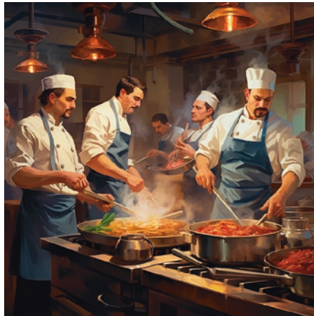
Figure 1-8. Midjourney kitchen

With each word and word combination, a drawing AI pulls associations, or contexts, from its knowledge base, where text is connected to images. (It does not keep any text or images “as is” but has the knowledge obtained by learning.) The associations happen on several levels: the lowest level of colors and textures, then, at higher levels, styles, objects, and actions. Several software components are working in parallel on each level. It is like several cooks preparing dinner together, each with their specific role (Figure 1-8).