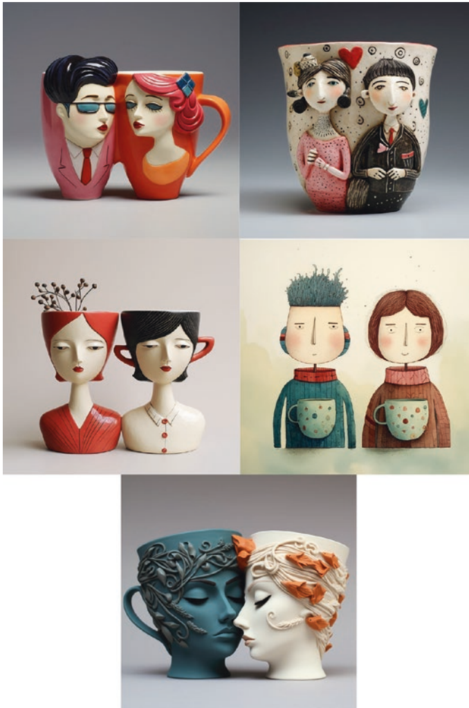
Figure 1-9. Cup couple, version 5.2

“Cup couple” is a two-word prompt that produces a variety of images. The simplicity of the prompt is part of the attraction (see Figures 1-9 and 1-10 for examples).