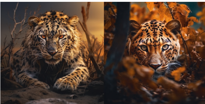
Figure 1-1. Wild animals – without and with adjectives