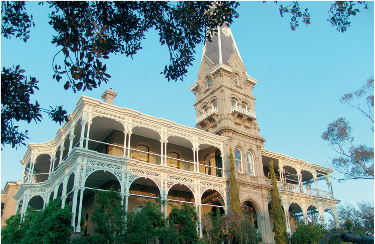
Rupertswood, on the outskirts of Melbourne - now a hotel but once the birthplace of the Ashes