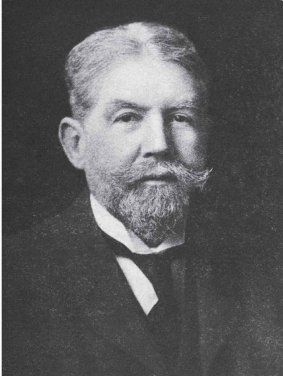
WG Grace - his wicket led to defeat at The Oval