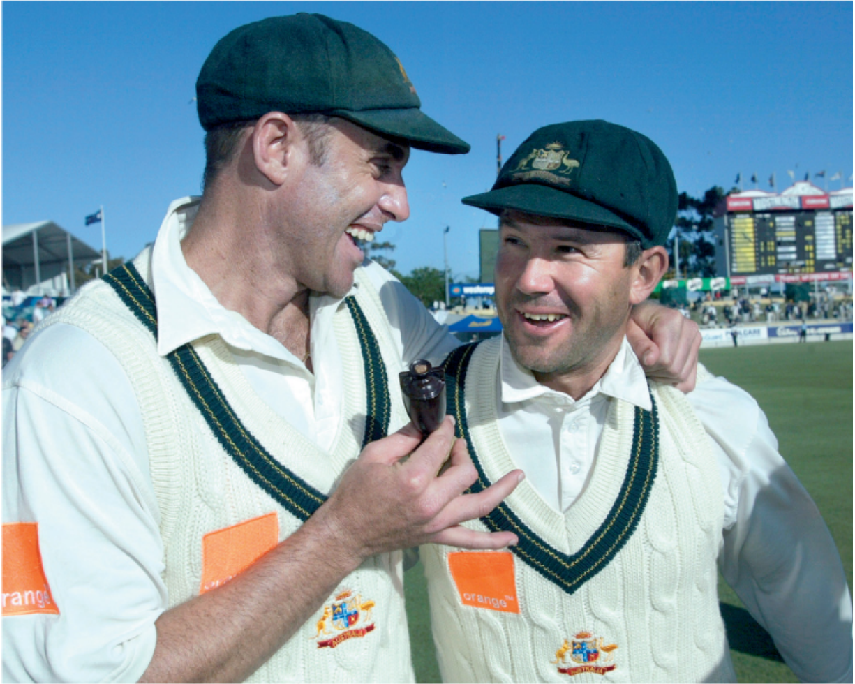
The urn said to contain the coveted Ashes - but the ashes of what?

The history of The Ashes is, naturally, a history of a team game. But it is also a history of players whose stories will be told as long as cricket is played. Here are some of those players and their stories.