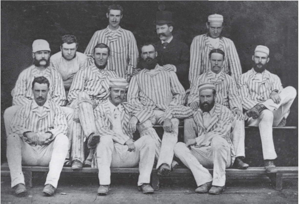
The first official Australian cricket team to visit England, in 1878

Thanks largely to Bannerman's 165 before he retired due to injury, Australia reached 245 all out in their first innings. England replied with 196 before Australia scored 104 in their second innings, with Shaw taking five for 38. This set the tourists a target of 154 to win, but Tom Kendall, ironically born in Bedford, took seven for 55 to bowl England out for 108, leaving Australia winners by 45 runs. It was an amazing coincidence that exactly 100 years later, in a match on the same ground to celebrate the centenary of the first Test, the result was precisely the same: Australia won by 45 runs.