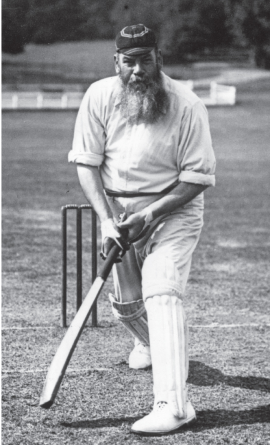
Ivo Bligh, captain of the first Ashes-winning team

In Melbourne, as everywhere else on the tour, the England team were feted lavishly, with Bligh responding to a toast to