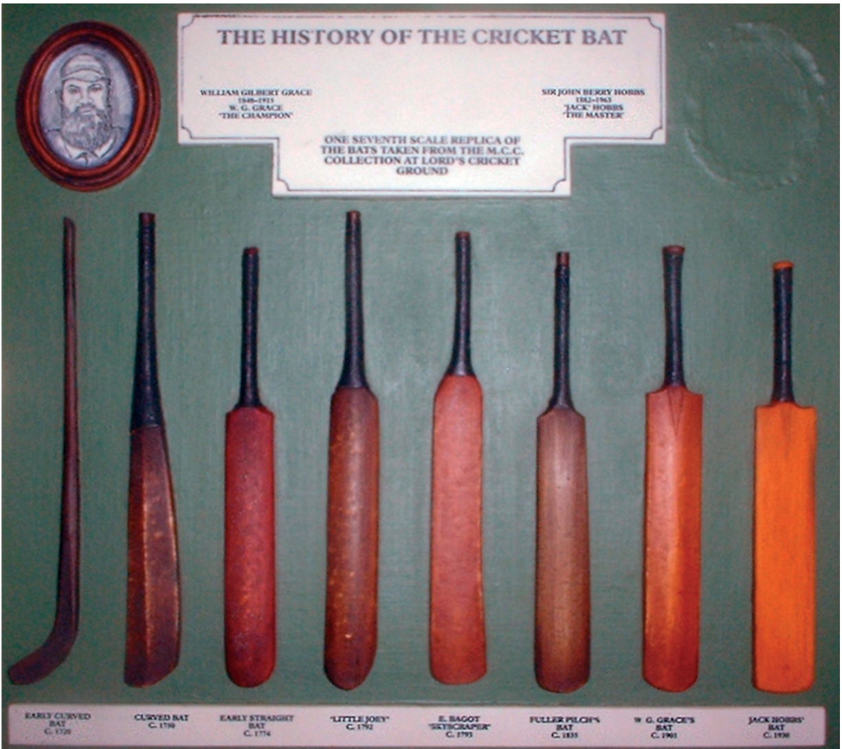
Fred Spofforth - central figure in the Ashes story

A month after embarking from England, the Peshawur reached Colombo, where Bligh's team played against 18 locals and then against the Royal Dublin Fusiliers before departing again for Adelaide. However, shortly after setting sail the ship was in collision and had to return to port for repairs. She was five days late arriving in Adelaide, where another fixture was completed, before the team continued to Melbourne, where the team arrived exactly two months after leaving England.