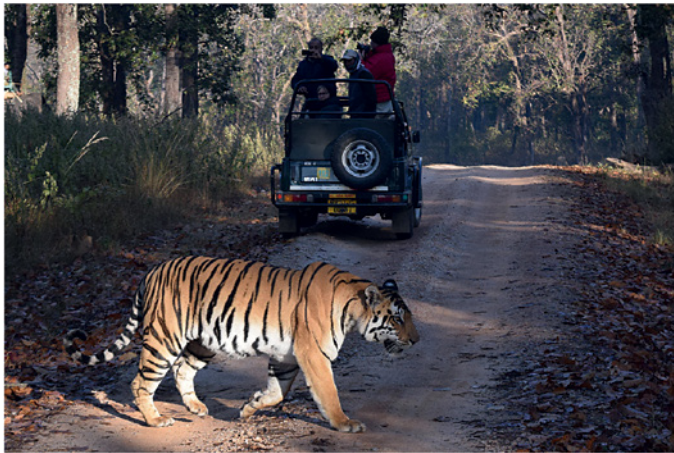
Figure 2.1 A tourist jeep closely approaching a wild tiger in an Indian national park.

and perhaps 8000 captive tigers in Asia, the majority in China (Abbott and Van Kooten 2011). Far more tigers exist in captivity than in the wild. In the USA, while a small number of tigers are on display in zoos accredited by the American Zoological Association (AZA) (for more discussion of the role of zoos in conservation, see Chapter 14), the rest are kept in roadside zoos or as exotic pets in private households. In East and Southeast Asia, many captive tigers are kept in what are widely labeled tiger farms, sometimes for entertainment but also contributing to markets in tiger parts (Dinerstein et al. 2007).