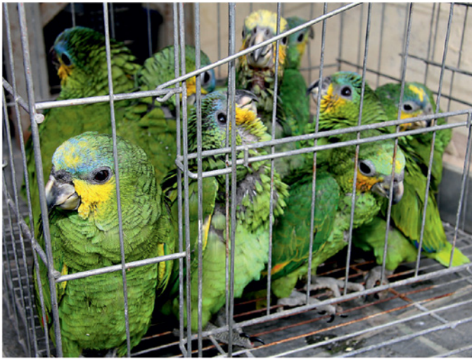
Figure 1.1 A cage full of wild parrots destined for the pet trade, seized by the Police in Brazil.

Granted, some populations and whole species of parrot are becoming scarce. But why does it matter whether parrot species decline or disappear? What's so concerning about the loss of species?