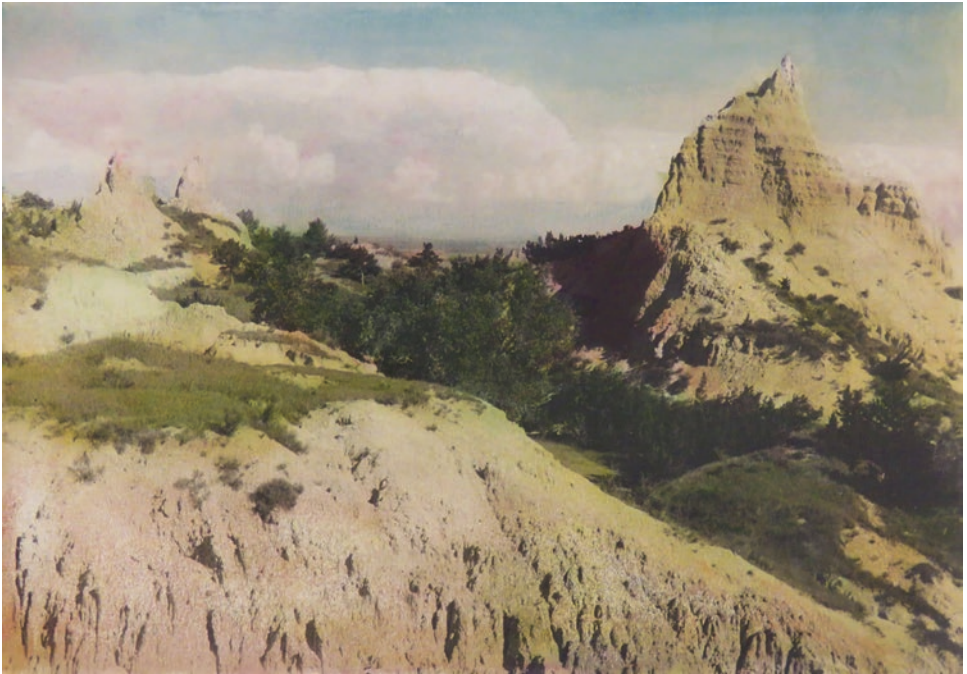
A view from near Cedar Pass looking east along the edge of the Wall of the Badlands. The hollow in the foreground is occupied by a small temporary lake formed by the blocking of one of the canyons by a large landslide. Cottonwood trees have become quite well established around this, as well as cedars, and considerable smaller vegetation. The Matterhorn-like butte to the right is capped by the Leptauchenia clays. (This favorite autochrome photograph of Harold Rollin Wanless was taken on July 3, 1920)