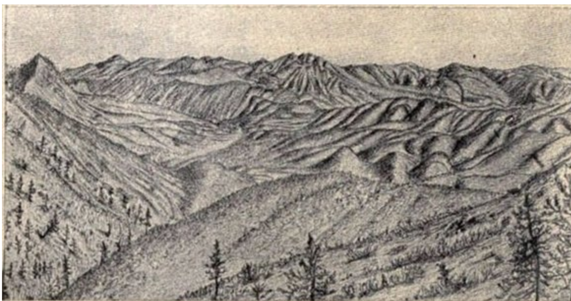
HORSESHOE BEND, MERCED RIVER

man's noblest sculptures. How wonderful the power of its beauty! Gazing awe-stricken, I might have left everything for it. Glad, endless work would then be mine tracing the forces that have brought forth its features, its rocks and plants and animals and glorious weather. Beauty beyond thought everywhere, beneath, above, made and being made forever. I gazed and gazed and longed and admired until the dusty sheep and packs were far out of sight, made hurried notes and a sketch, though there was no need of either, for the colors and lines and expression of this divine landscape-countenance are so burned into mind and heart they surely can never grow dim.