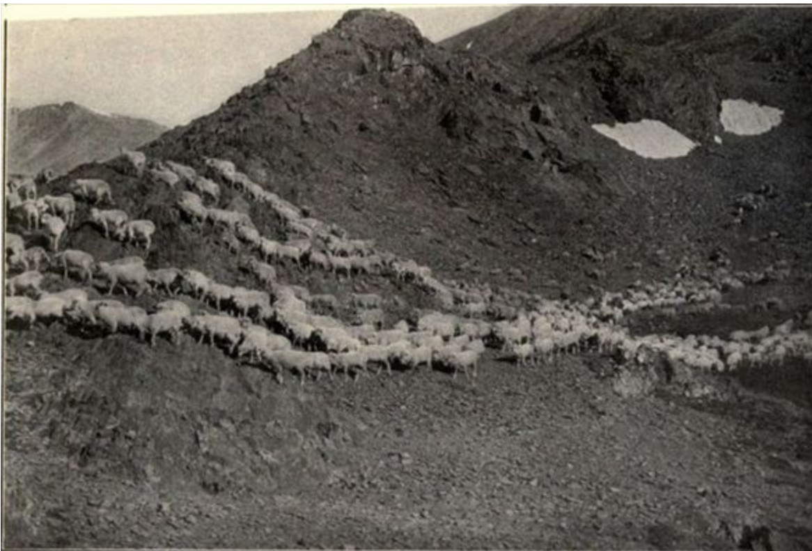
Sheep in the Mountains

The flock traveled at the rate of about a mile an hour, outspread in the form of an irregular triangle, about a hundred yards wide at the base, and a hundred and fifty yards long, with a crooked, ever-changing point made up of the strongest foragers, called the "leaders," which, with the most active of those scattered along the ragged sides of the "main body," hastily explored nooks in the rocks and bushes for grass and leaves; the lambs and feeble old mothers dawdling in the rear were called the "tail end."