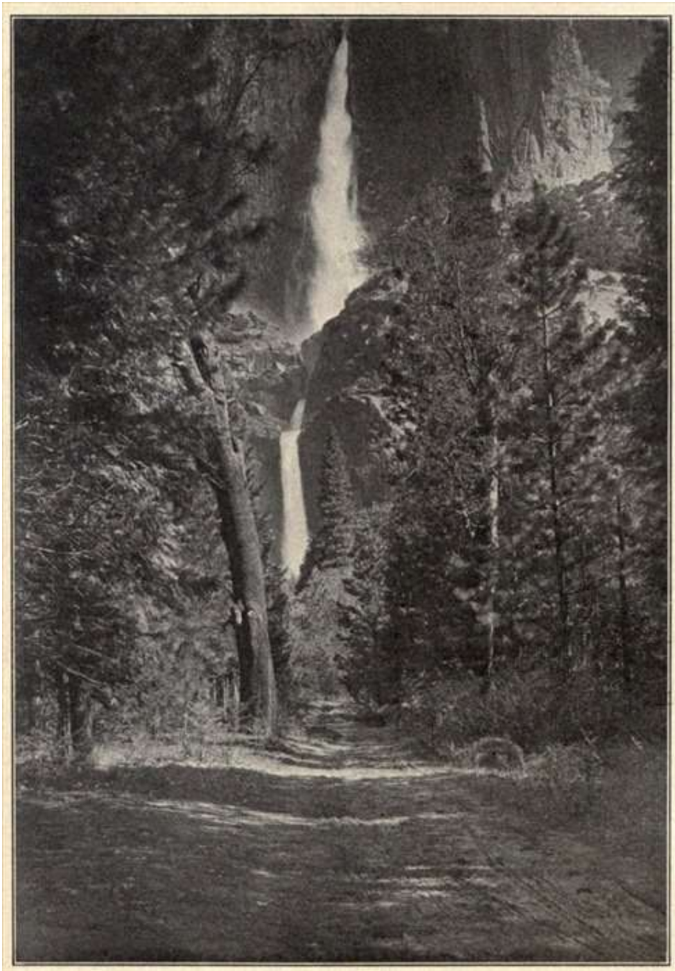
The Yosemite Falls, Yosemite National Park