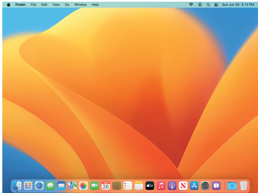
FIGURE 1-2: The desktop after a brand-spanking-new installation of macOS Ventura.

The fact that something went wrong is no reflection on your prowess as a Mac user. Something is broken, and your Mac may need repairs. If this is happening to you right now, check out Chapter 23 to try to get your Mac well again.