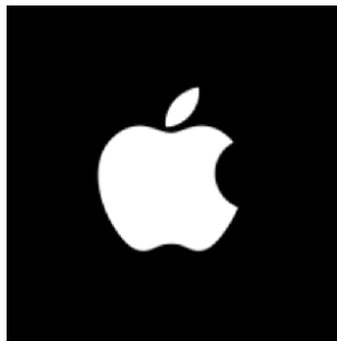
FIGURE 1-1: This is what you'll see if everything is fine and dandy when you turn on your Mac.

When you finally do turn on your Mac, you set in motion a sophisticated and complex series of events that culminates in the loading of macOS and the appearance of the macOS desktop. After a small bit of whirring, buzzing, and flashing (meaning that the OS is loading), macOS first tests all the Mac's hardware — slots, ports, disks, random access memory (RAM), and so on. If everything passes, you'll see a tasteful whitish Apple logo in the middle of your screen, as shown in Figure 1-1.