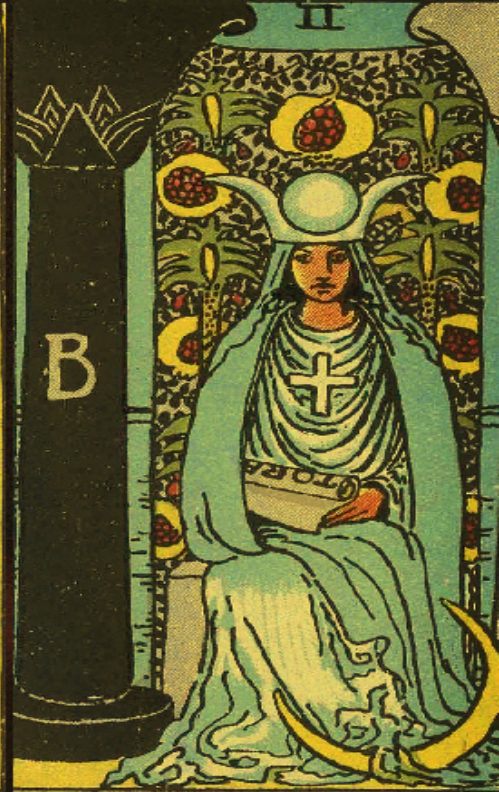
THE HIGH PRIESTESS.