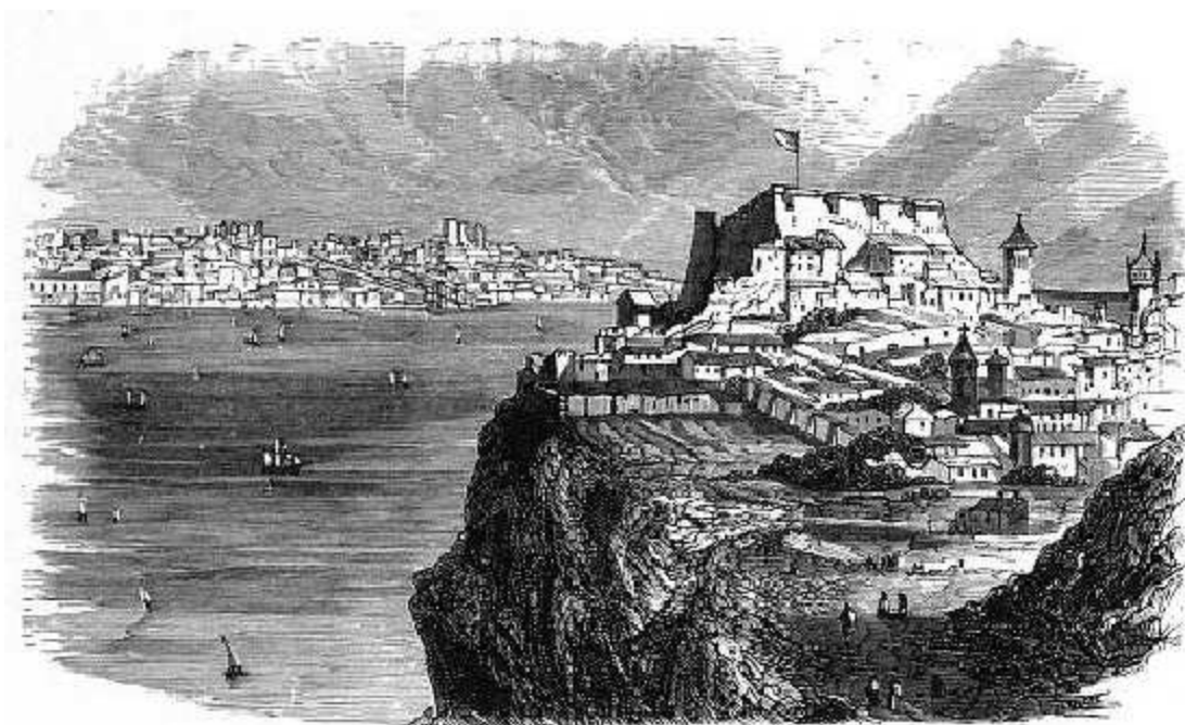
Lisbon, from the south bank of the Tagus.

In the service of the King against the Moors in one of the Portuguese wars, he received a wound which healed, but left him lame for life. He, like other officers, sent in his claim for the pension due to such service. He received answer from the parsimonious King (Dom Manoel):