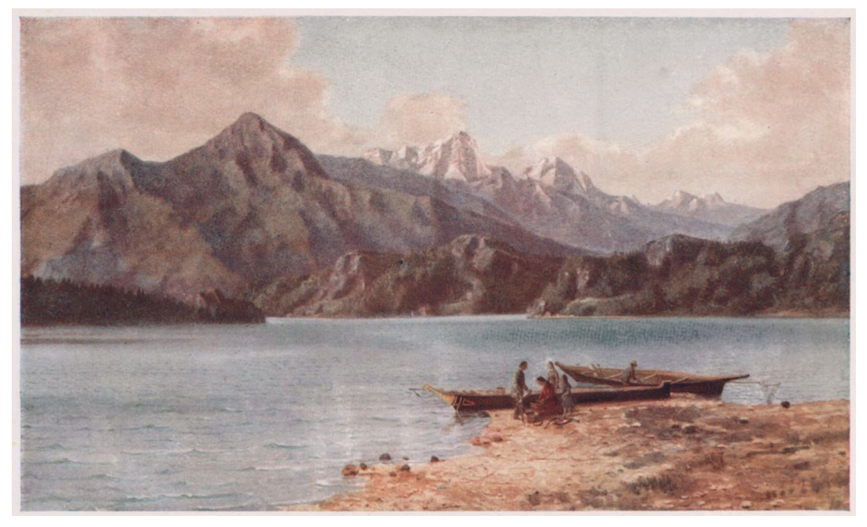
NORTH OF HOWE SOUND, PACIFIC COAST, BRITISH COLUMBIA

It is this possibility as to character, this promise of a strong, individual, intellectual, ethically-governed manhood, that gives most hope for the Canada of the future. Not all the millions of acres of wheat-lands of her prairies, not all her cities of smoking factories and busy commerce in the east and west, will succeed in making her dominant in the world-arena, as will the strong personality, the unflinching character, of her coming men.