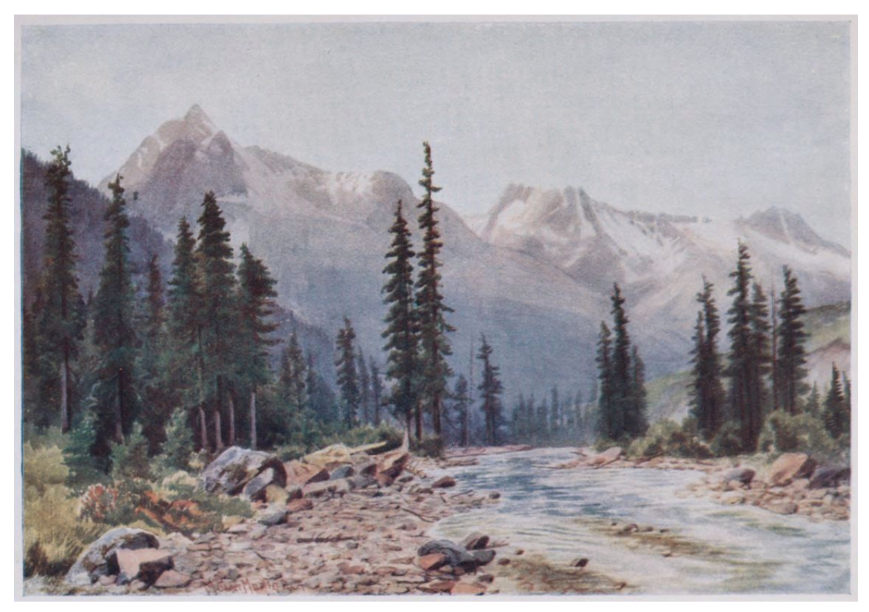
MOUNT CHEOPS AND THE HERMIT RANGE

Then there are the English, the sturdiest, the most independent stock of men in the whole world; and next follows the north of Ireland Scot, who has perhaps more than any other class dominated and moulded the character, and affected the speech and accent, of the Canadian people.