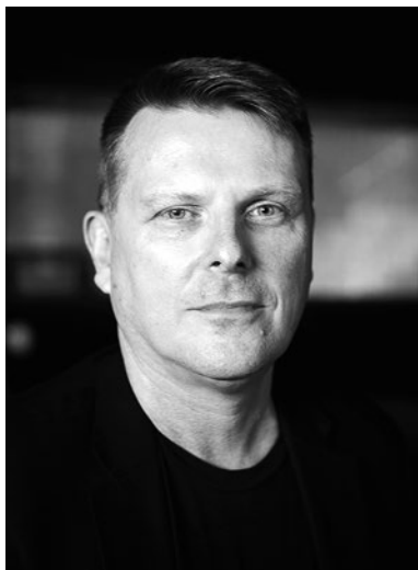
of the author at the Australian Film Television and Radio School (AFTRS)