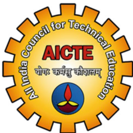
All India Council for Technical Education (AICTE)