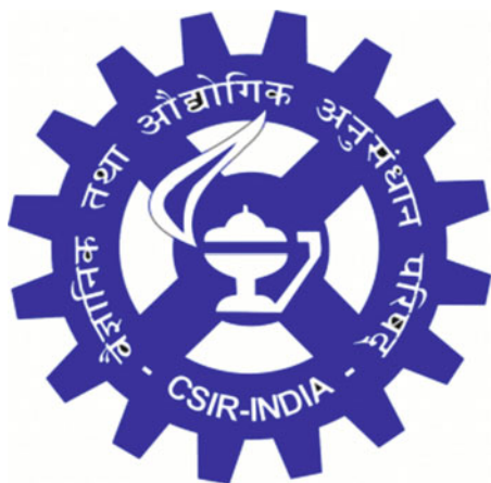
Council of Scientific and Industrial Research (CSIR)