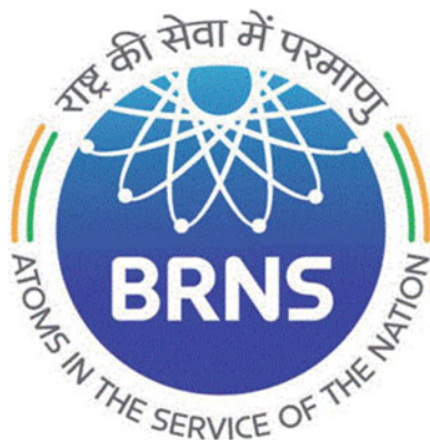
Board of Research in Nuclear Science (BRNS)