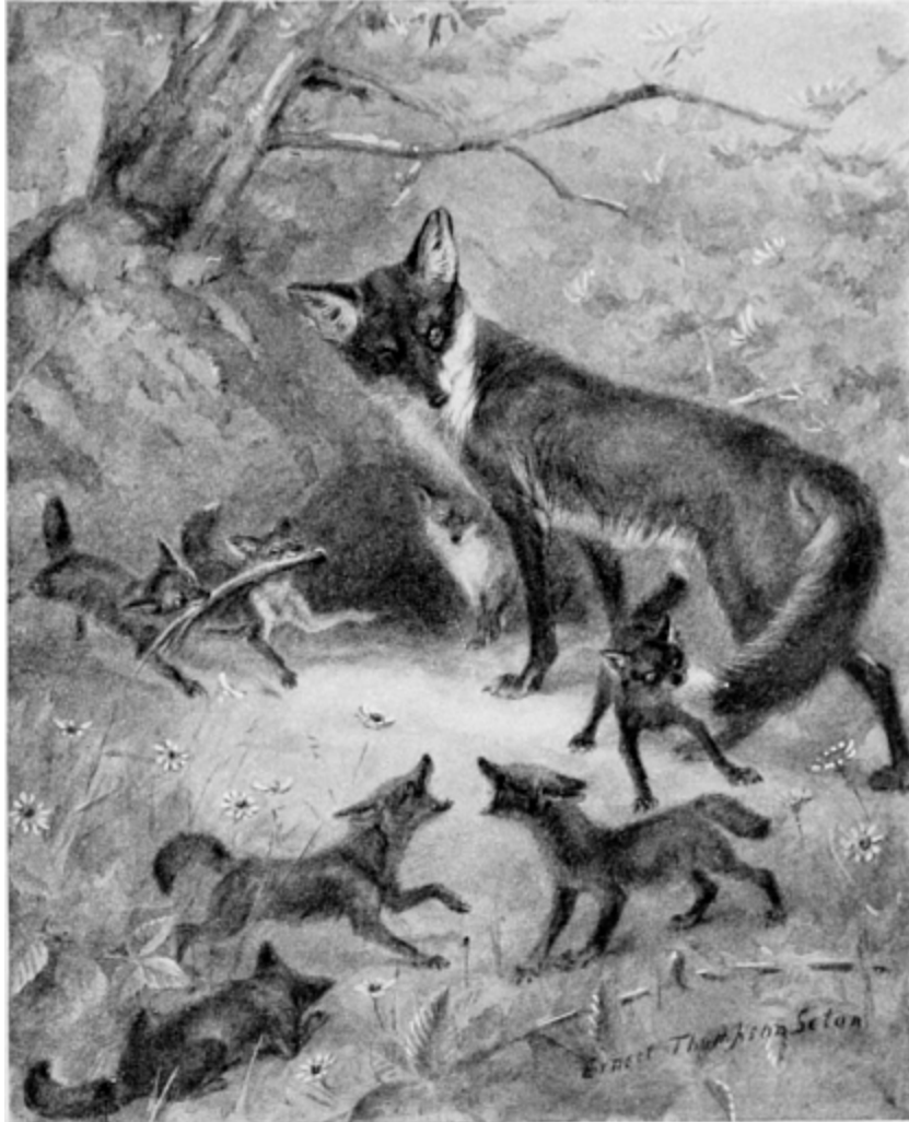
DOMINO'S EARLY HOME

Mother looked on with love and seeming admiration, but she divided her attention between the happy group about the meal and the near woods, which might contain a lurking foe; for men with guns, boys and dogs, eagles and owls, all are ready to make quarry of a baby fox. She never relaxes her vigilance, and is ably backed by her mate, who, though secondary in family matters and not allowed in the den while the young are blind sucklings, is nevertheless a faithful provider of food and a tireless sentinel.