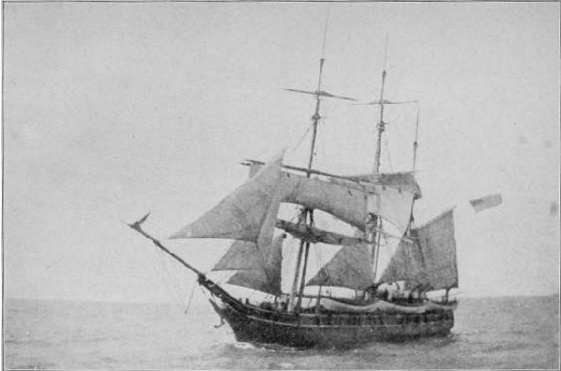
In Bowhead Waters

Next day the runner for Levy's tried to ship me aboard the steam whaler William Lewis . When we arrived at the shipping office on the water front, it was crowded with sailors and rough fellows, many of them half drunk, and all eager for a chance to land a berth. A bronzed and bearded man stood beside a desk and surveyed them. He was the skipper of the steamer. The men were pushing and elbowing in an effort to get to the front and catch his eye.