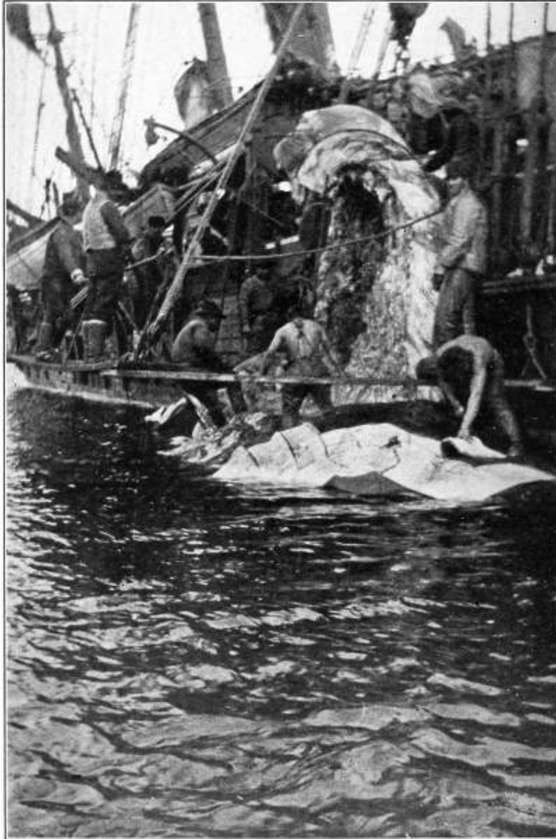
"Cutting Out" A Whale