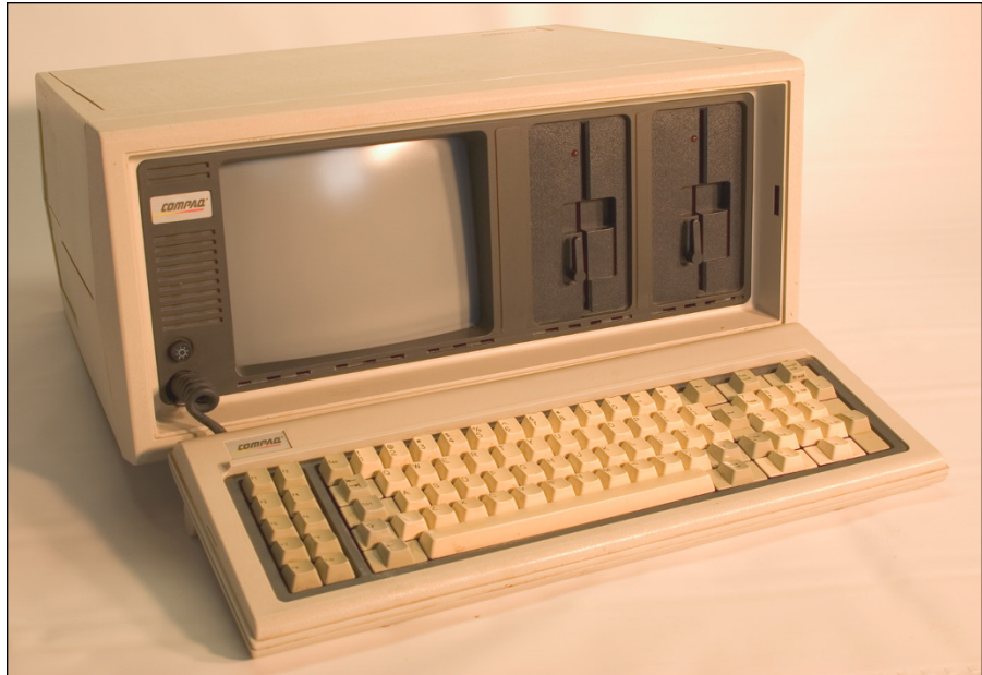
FIGURE 1-2: The luggable Compaq Portable.