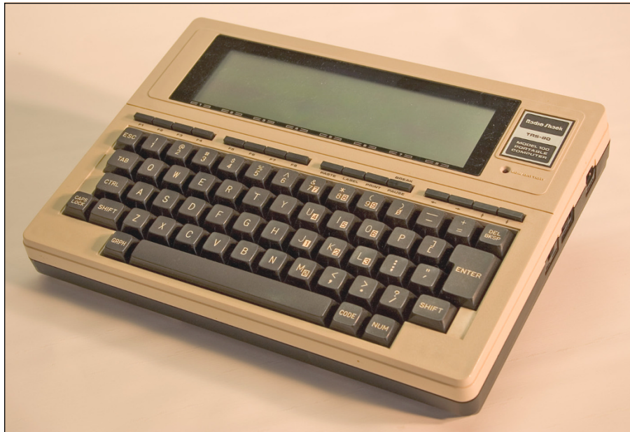
FIGURE 1-3: The Radio Shack Model 100.

The Model 100 wasn't designed to be IBM PC compatible, which is surprising considering that PC compatibility was all the rage at the time. Instead, this portable computer offered users a full-size, full-action keyboard plus an eensie, 8-row, 40-column LCD text display. It came with several built-in programs, including a text editor (word processor), a communications program, a scheduler, and an appointment book, plus the BASIC programming language, which allowed users to create their own programs or obtain BASIC programs written by others.