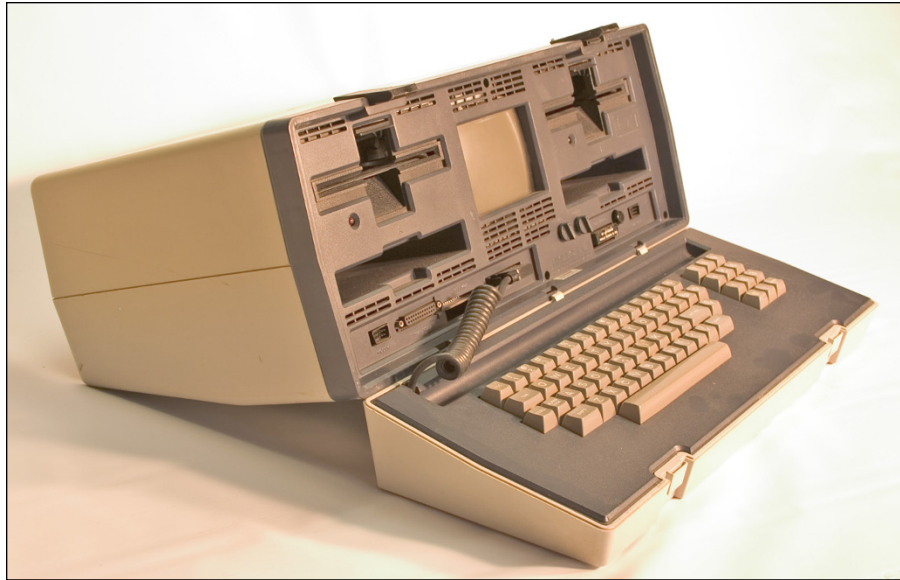
FIGURE 1-1: A late-model Osborne.

Never mind its weight. Never mind that most luggable computers never ventured from the desktops they were first set up on — luggables were the best the computer industry could offer an audience wanting a portable computer.