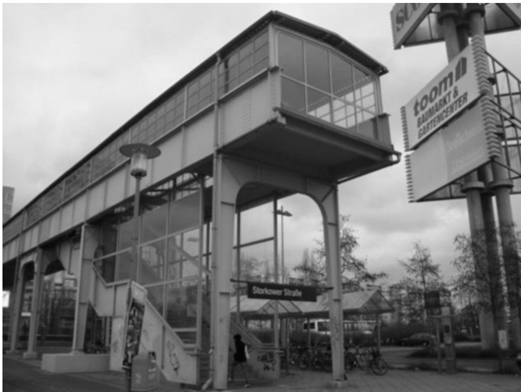
S-Bahnhof Storkower Straße: verkürzter Überweg

Berlin's central cattle and slaughterhouse was once located at the Storkower Strasse S-Bahn station in Berlin-Lichtenberg. A 420 m long pedestrian bridge was built in 1937 to cross the area. In 1976-77, it was extended to 505 m to the S-Bahn station Storkower Straße and was thus Europe's longest pedestrian bridge. Its nicknames, of which Langes Elend (Long Misery), Angströhre (Tube of Fear), Rue de Galopp (Galop Road), however, show that this was not a pleasant crossing. In 2002, a 300 m long middle section was demolished, but also a 45 m long section was renovated to become the S-Bahn station. In 2006, a remaining section on Eldaer Straße also fell victim to the wrecking ball. Today you can reach the S-Bahn station and the other side of the tracks over the rest of the bridge, but you cannot cross the closed down cattle market anymore. The former Langer Jammer/ling misery now ends abruptly.