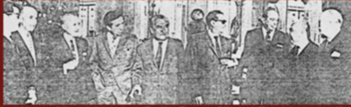
Dos Ex Presidentes de México: Miguel Alemán y Emilio Portes Gil, y el Presidente Adolfo López Mateos (Centro) después de discutir la reestructuración y organización de la Academia Mexicana de derecho Internacional, con varios funcionarios, en la casa del Lic. Ezequiel Padilla y queda instituida la Orden mexicana del Derecho, la Cultura y la Paz., diseñándose la condecoración.