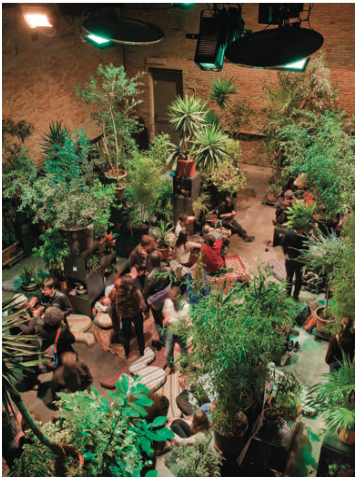
Garden State , Teatro Fundamenta Nuove, Venice (2014)