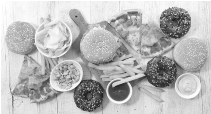
Photo 1.3: A variety of not so healthy high-fat foods (junk foods)

Triglycerides are made up of a glycerol molecule linked to three long-chain fatty acids . The chains are formed from repeating hydrocarbon units. Fatty acids can either be saturated (meaning they contain only single bonds between the carbon atoms in the chain) or unsaturated (meaning they contain at least one double bond between the carbon atoms in the chain). Monounsaturated fatty acids contain just one double bond in their hydrocarbon chain whereas polyunsaturated fatty acids (PUFA) contain two or more double bonds. Two of the PUFAs, linoleic acid and alpha-linolenic acid , are essential nutrients for humans. Saturated fat comes from animal products in our diet whereas most of our unsaturated fat comes from plants. The American Heart Association recommends limiting saturated fats because many studies have shown that a diet high in saturated fat can raise your "bad" cholesterol and put you at higher risk for heart disease.