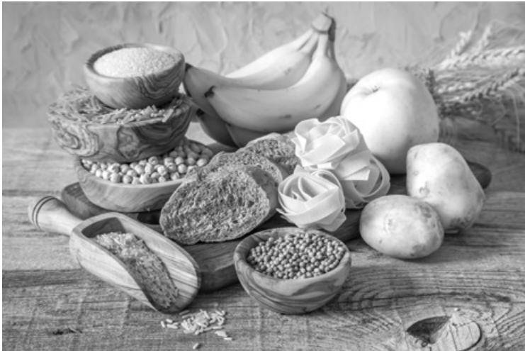
Photo 1.1: A variety of high-carbohydrate foods

celery, spinach and salad leaves (photo 1.2). Fiber cannot be digested by enzymes in the human stomach and small intestine, and so it passes into the large intestine ( colon ) largely unchanged. In the large intestine, most soluble fiber (that is fiber that dissolves in water) can be broken down into sugars by the resident population of bacteria (in total there is about one kilogram of bacteria in our colon) known as the gut microbiota . The bacteria rapidly ferment these sugars to produce short-chain fatty acids such as butyric acid which can be used as an energy source by both the bacteria themselves and the human cells that line the colon. Soluble fiber makes up about 70% of the fiber in our diet and has an energy value of around 1.5 kcal per gram. Most insoluble fibers (e.g., cellulose and lignins that form the structure of plant cell walls) are not digested or fermented at all and are excreted unchanged in the feces and hence have zero energy value to humans.