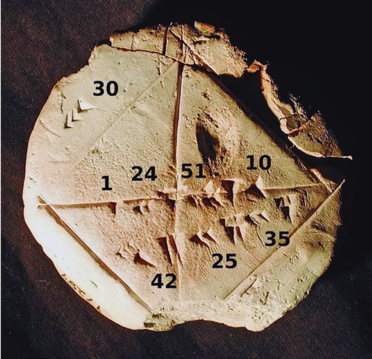
Figure 1.1: They were not just counting goats and sheep in Babylonian times. This is the cuneiform Babylonian school tablet YBC 7289 from 1600–1800 B.C. See text for explanation.