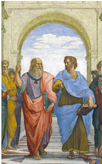
Figure 1.2: The central figures of the famous painting, Socrates in Athens speaking with Plato , painted by Raphael. It resides in the Vatican. (Image in public domain.)

All this serves to remind us that when we wish to make meaningful statements about the world, we need to proceed with caution. Even the ideal world of Mathematics has some pitfalls to be wary of.