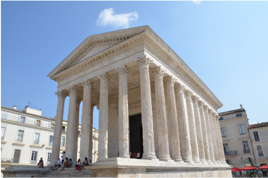
Figure 1.2 Roman temple (Maison Carrée in Nîmes, France, one of the best-preserved Roman temples, an Augustan provincial temple of the Imperial cult).

supervision of the community in all its facets. Urban temples and shrines were numerous and offered opportunities for people to demonstrate their respect for the gods and their beneficial contributions to the community. Much of the city of Rome itself was deemed sacred territory within the pomerium (the plowed line for the original city drawn by Romulus). No weapons or burials were permitted within this zone, and magistrates holding imperium (sacred power for certain offices) could not exercise it within the sacred precincts of the city.