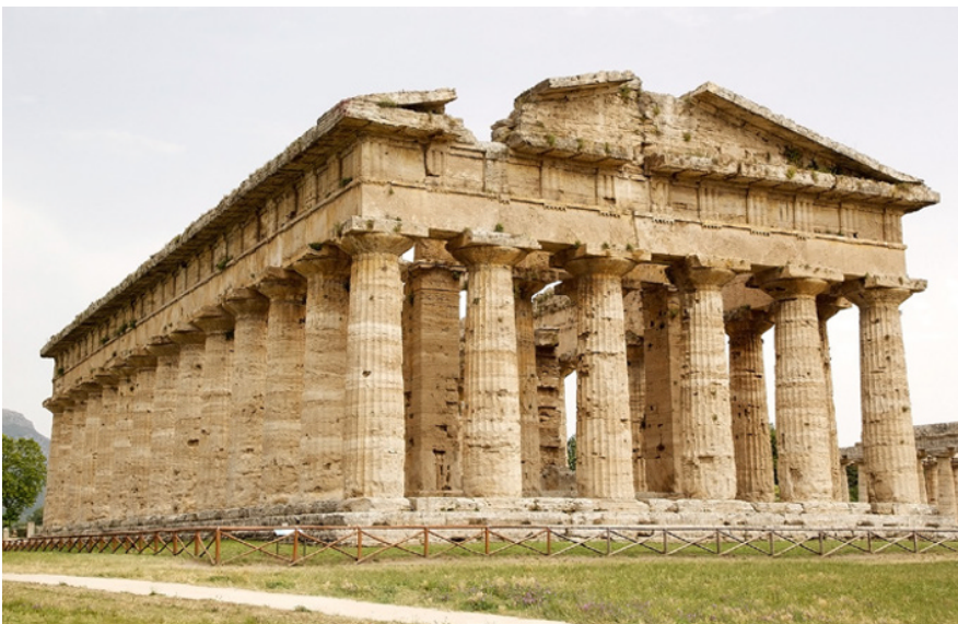
Figure I.1 Greek temple (Temple of Neptune, 460 BCE).

Within a town or city, sacred space was most commonly located in temples and shrines near the agora (Greek), or the forum (Roman). Temples and shrines close to these central meeting places facilitated the divine protection and