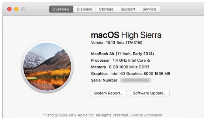
FIGURE 1-4: See which version of macOS you're running.

If you're curious or just want to impress your friends, OS X version 10.12 was known as Sierra; 10.11 was El Capitan; 10.10 was Yosemite; 10.9 was Mavericks; 10.8 was Mountain Lion; 10.7 was Lion; 10.6 was Snow Leopard; 10.5 was Leopard; 10.4 was Tiger; 10.3 was Panther; 10.2 was Jaguar; 10.1 was Puma; and 10.0 was Cheetah.