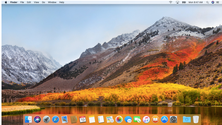
FIGURE 1-2: The macOS High Sierra desktop after a brand-spanking-new installation of macOS High Sierra.