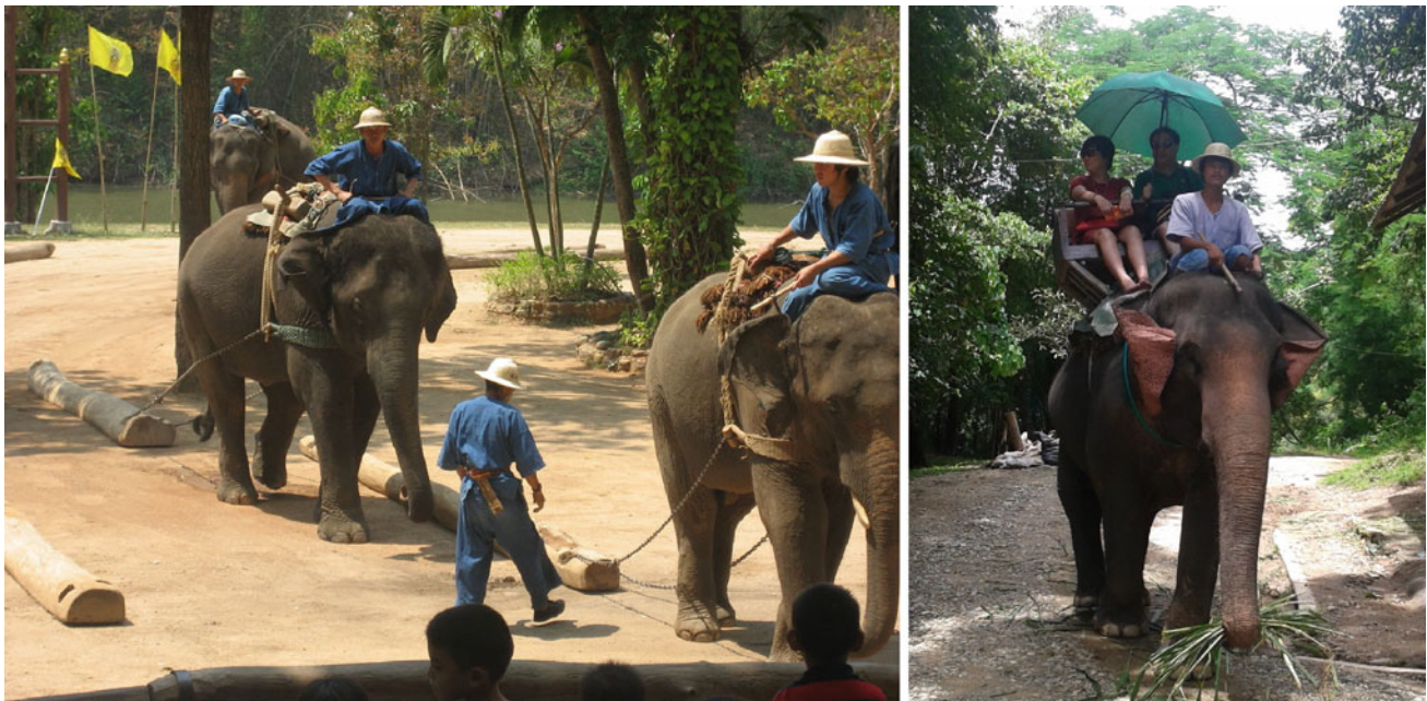
Fig. 1.4 Chinese visitors enjoying a ride on the Elephant's back guided by a Thai Mahout at Maesa Elephant Camp ( right picture ), in Chiang Mai province, Northern Thailand, and Elephants pulling logs at Thai Conservation Centre, in Lampang, near Chiang Mai. In both places, elephants are attractions for visitors with interactive situations,

shows, displays, feeding, and rides, but as the reader can note the elephants look healthy, and they are not all the time available for the visitors. There is a schedule for shows, feeding and bath.