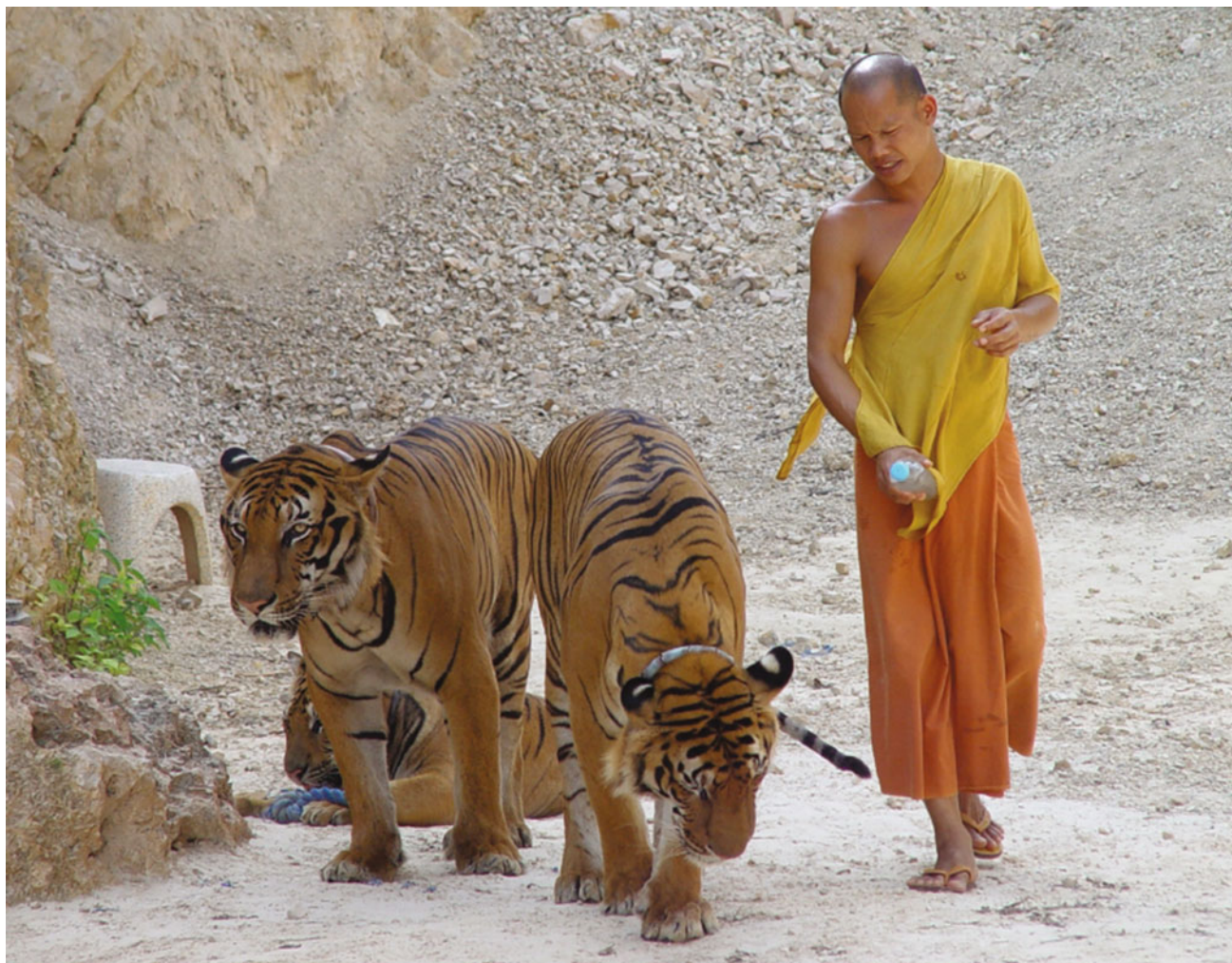
Fig. 1.2 A Monk walks close to tigers at Thailand's Temple. Source Wat Phra Luang Ta Bua, Kanchanaburi Province, Thailand. Date 13 June 2004. Creative Commons license (CC BY-SA 3.0). Credits to: Michael Janich

Thailand's Tiger Temple with the presence of more than 500 wildlife officials, veterinarians and police to rescue 137 tigers (by Ramsey, June 2016, Aljazeera Online) (Figs. 1.2 and 1.3), scientifically named Panthera tigris tigris . For decades, the Temple has kept the tigers under the status of a wild animal conservation and protection, but using them to steadily cash out as major tourism attractions alluring thousands of visitors every year, massively formed by foreigners, "with an entrance fee of anything from 600 baht ($17) to 5000 baht ($140) per person, millions of dollars have flowed into the temple over the years" (by Ramsey, June 2016, Aljazeera Online). After years of allegations of animal abuses by multiple non-governmental organizations against the Buddhist Temple, the Thailand's Department of National Parks, Wildlife and Plant Conservation—DNP, decided to act on behalf of the "big cats" (Fig. 1.2). With regards to the tigers' situation in Asia, animal groups have been alleging for years on cruelty, illegal wildlife trafficking